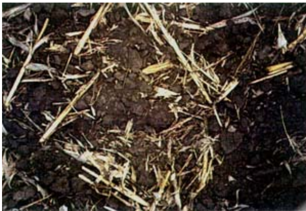
Grain Sorghum residue, 25% cover