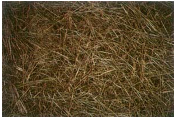
Wheat residue, 90% cover