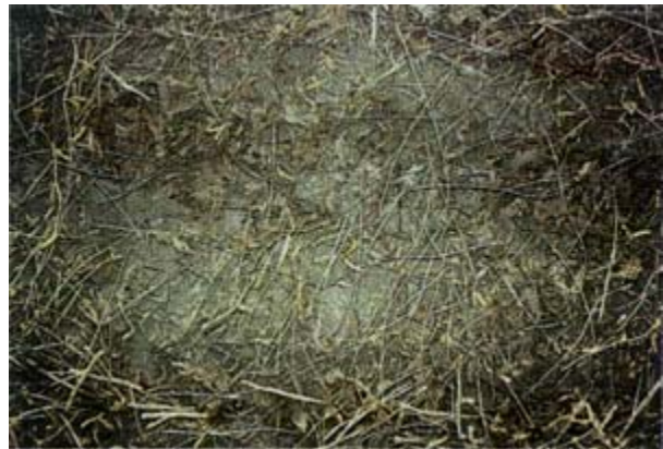
Soybean residue, 50% cover