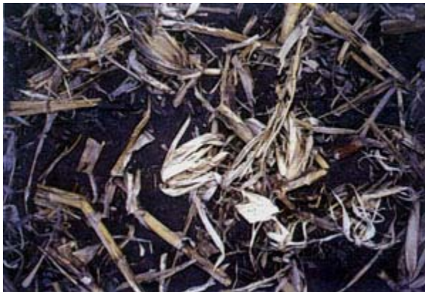
Corn residue, 75% cover