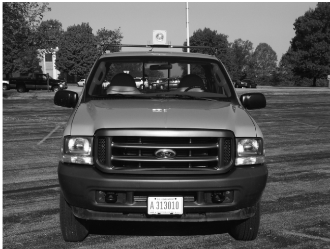
Figure 1. Ford F-250 pickup truck (Ford Motor Co., Dearborn, MI) used during an experiment (1 Feb–30 Oct 2006, Erie County, OH, USA) that exposed free-ranging white-tailed deer to the truck's approach while exhibiting one of 3 lighting treatments: 1) tungsten-halogen (TH) lamps only, 2) TH lamps with a high-intensity discharge (HID) lamp set to a 2-Hz pulse rate, or 3) TH lamps with constant HID lamp illumination. General Electric (Cleveland, OH) sealed-beam TH (type 2B1; 13-V, 65-W) lamps were installed on the truck at the factory. A 35-watt Osram (Munich, Germany) D1S Xenarc™ HID lamp was installed on the cab.

which included a built-in meter by which we monitored the pulse rate (Hz) of the lamp. The HID lamp and the Pulselite were powered by connection to a 10-amp outlet in the truck.