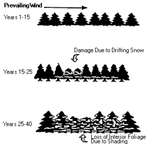
Figure 3. Foliage loss in multi-row single species conifer windbreaks.