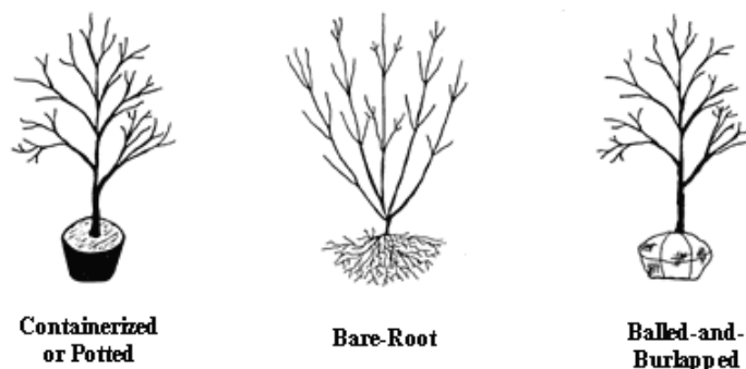
Figure 2. Types of planting stock.

Time and effort should be spent on site preparation prior to planting. Major soil deficiencies should be identified and corrected before planting or a better planting site should be selected. It is especially important to locate all underground utilities before digging. In Nebraska, state law requires that you contact the "digger's hotline." Check the area for subsurface drainage and be certain plant placement will allow for proper growth and development (do not plant large trees under power lines).