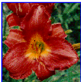
"Rose Prelude."

Daylilies are able to withstand heat and drought better than many garden flowers. They are also completely winter hardy and have an excellent ability to survive floods and drought. Even with the ability to survive floods, they do not like waterlogged soils and require good drainage. Daylilies will grow well when planted on high banks near streams and ponds as well as in perennial borders and for naturalizing in less formal gardens. Low-growing types can be an excellent addition to rock gardens.