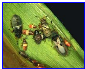
Figure 1. Chinch bug life stages.

Fully grown chinch bugs are about 3/16 inch long, with a black body and white forewings. Newly-hatched bugs are small and bright red. All life stages feed on susceptible grass plants between the leaf sheath and stalk ( Figure 1 ). As the young bugs (i.e., nymphs) grow, they shed their skin (i.e., molt) five times in going through six stages. They are red to brown with a white band across their backs