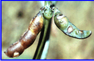
Figure 3. Soybean pod showing typical feeding damage by the bean leaf beetle.

An inverse relationship between defoliation and seed yield has been documented in Nebraska: as defoliation increases, seed yield decreases.