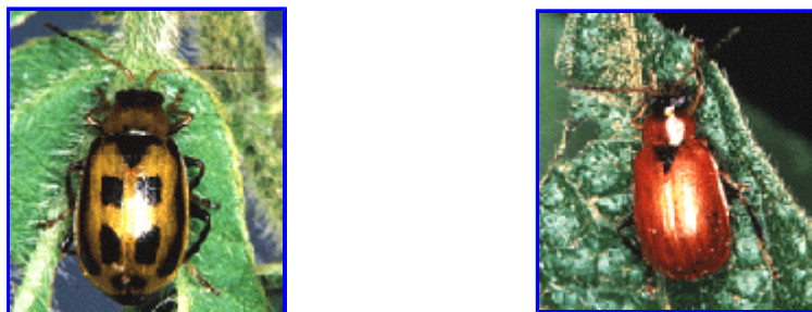
Figure 1. Adult bean leaf beetles: a) typical adult and b) atypical adult. Note darkened triangular shaped marking at base of wings.

These spots and the black border may be missing or less pronounced ( Figure 1b ). However, in all cases there is a small black triangular-shaped coloration at the base of the wing covers near the thorax ( Figures 1a & 1b ).