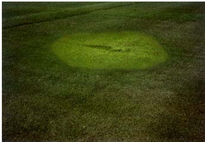
Figure 1. Green "doughnut" typical of leaking valves or sprinkler heads.

Use the application rate information, along with soil infiltration rate, to determine the length of time the system should run to apply necessary water while avoiding runoff. (See Evaluating your Landscape Irrigation System , G93-1181-A).