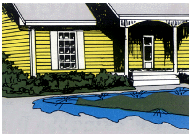
Figure 2. An irrigation system should apply water only to desired landscape areas. Note proper application (top) and improper water wasting application (bottom).