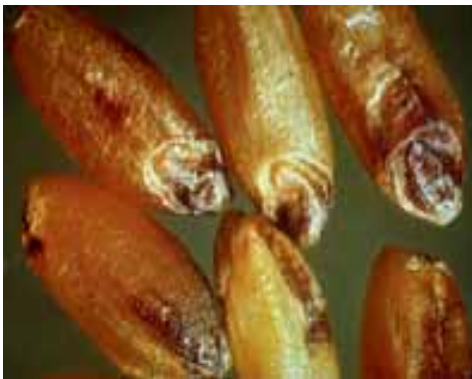
7. Black point