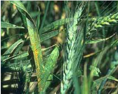
1. Leaf rust