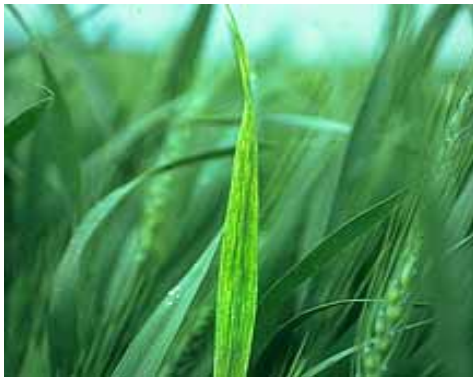
10. Wheat streak mosaic