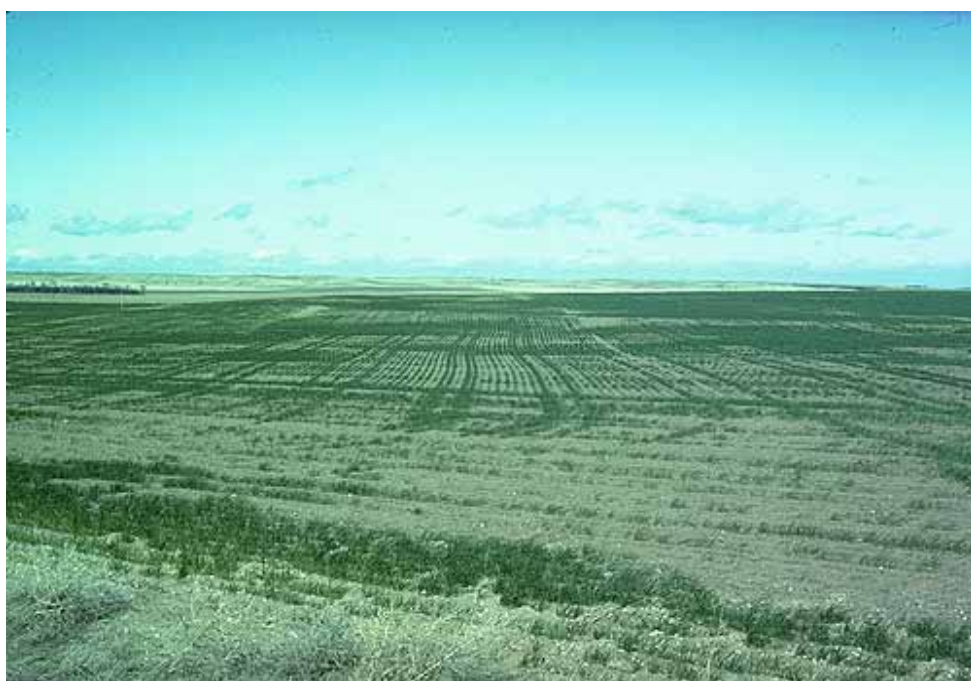
Figure 1. A loose seedbed can contribute to disease development.

A healthy root system is critical to wheat's ability to tiller and produce large heads. Healthy roots are needed to support growth. When diseased, they fail to deliver the appropriate balance of nutrients, water and growth factors during the early stage of growth and development. This results in the failure of tiller buds to activate or causes the formation of small leaves and heads on the main stem and on tillers