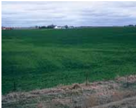
11. Soil-borne wheat mosaic