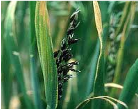
4. Loose smut