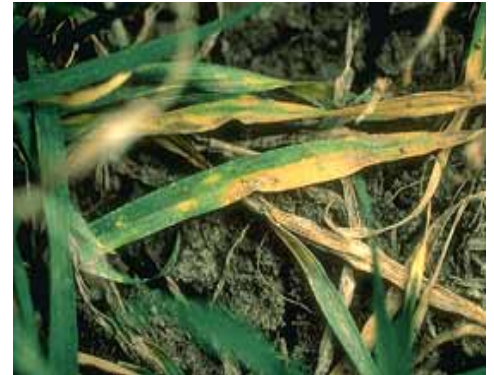
3. Septoria leaf blotch