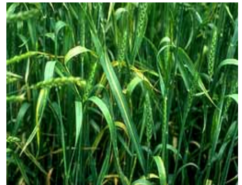
9. Cephalosporium stripe

already initiated. Crown and root diseases cause a reduction in the number and size of heads and/or a loss of stands, plus make the crop less competitive with weeds.