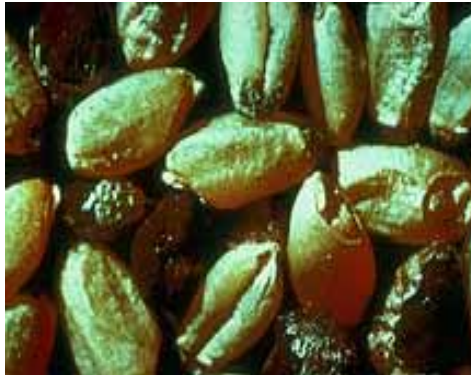
5. Common bunt