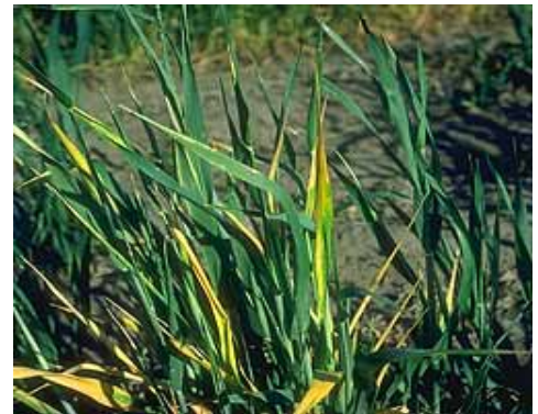
12. Barley yellow dwarf

diseases are a potential threat. The pathogens of these four diseases are associated with wheat residues so planting wheat into the residue of another crop is an important deterrent to their development.