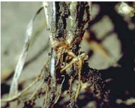
8. Root and crown rot