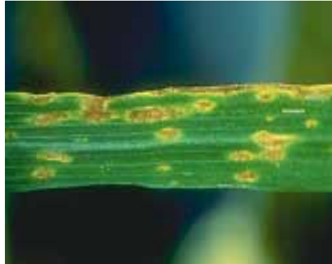
2. Tan spot