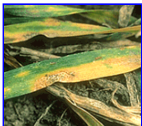
Figure 2. Septoria pycnidia on leaf lesion. (34K JPG)

Symptoms appear first as small, chlorotic flecks restricted by veins. These subsequently develop into spots that tend to develop longitudinally ( Figure 1 ) to form tan to reddish-brown, irregular-shaped blotches which are often surrounded by a yellow margin. As the blotches age, their centers become light brown to ashen, followed by the appearance of small black specks ( Figure 2 ). These specks are pycnidia, the spore-producing bodies of Septoria fungi. The presence of pycnidia is the most reliable field sign for distinguishing