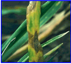
Figure 3. Severely infected leaf. (19K JPG)

Septoria fungi overwinter on infected plant refuse and on volunteer wheat. The pathogen may infect winter wheat seedlings soon after emergence in the fall. Infection occurs during cool, wet weather and continues to increase and spread until checked by temperatures that are consistently below 40°F. The pathogen survives as mycelium or pycnidia on the leaves of plants or in volunteer wheat during mild winters.