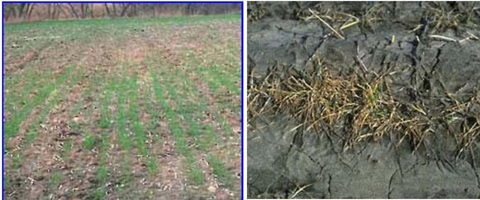
Figure 3. Severe root and crown rot. Plants killed by root and crown rot.

Symptoms on the aerial parts of wheat associated with root and crown rot include wilting, stunting and chlorosis. Preemergent and postemergent damping-off of wheat seedlings caused by root and crown rot fungi is generally not a serious problem in Nebraska.