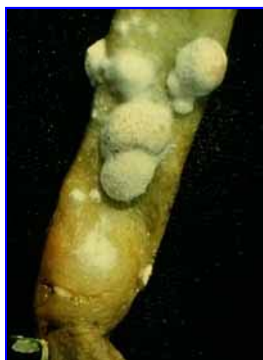
Figure 5. Sclerotial formation on infected pods. White moldy growth darkens with age and becomes sclerotia.

The fungus spores must come in contact with and colonize dead or senescent plant tissue such as flowers on the soil surface beneath the plant canopy ( Figure 4 ). These colonized flowers also may be lodged in branch axils or stuck to developing pods.