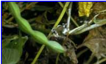
Figure 1. Symptoms of white mold disease. Note soft rotting on pods and white moldy growth.

One of the most important diseases affecting dry beans in western Nebraska and Colorado is white mold caused by the fungus Sclerotinia sclerotiorum . In a recent year, losses from this disease averaged as high as 20 percent, with a few individual field losses exceeding 65 percent.