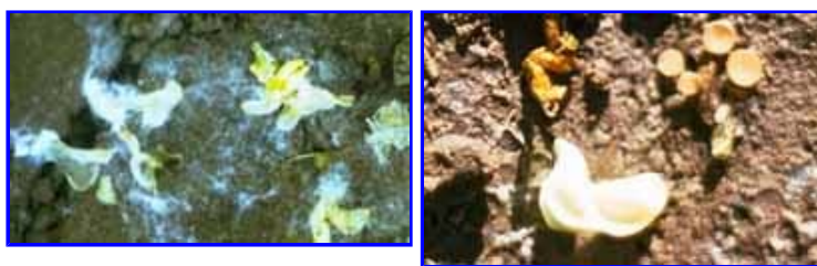
Figure 4. Fungal growth on senescent blossoms and leaves.