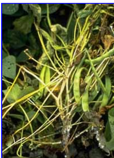
Figure 2. Entire plant infected with Sclerotinia sclerotiorum . Note white, bleached stems and wilted leaves.