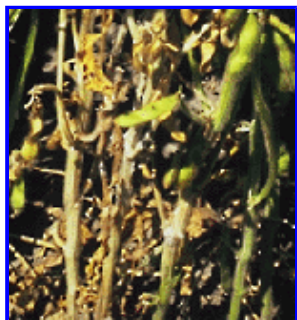
Figure 3. Soybean stems infected with Sclerotinia stem rot turn from brown to tan to a bleached color.

and pods for white mycelium and sclerotia to differentiate Sclerotinia stem rot from other diseases.