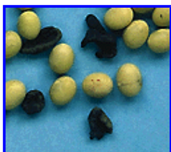
Figure 5. Sclerotia are similar in size to soybeans but can be distinguished by their dark color and also often by shape. It is important to clean seed carefully to reduce spread of the stem rot.