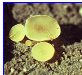
Figure 1. (Left) Sclerotia, which range from 1/16 to 3/4 inch long, are tightly packed white mycelium covered with a dark, melanized protective coat. Sclerotia survive the winter and produce either apothecia (right) or mycelium. Apothecia are mushroom-like bodies ranging from 1/8 to 3/8 inch in diameter on the soil surface. They can produce millions of airborne spores which can infect plants a few feet from the apothecia.