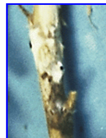
Figure 4. Symptoms of the disease usually appear as white, fluffy mycelium during humid periods and then as sclerotia on the surface or embedded in the plant tissue in the later development.

Since blossoms are infected first, early stem or pod water-soaked symptoms often result from colonized flowers. In a few days diseased stem areas are killed and become tan and eventually bleached ( Figure 3 ). This bleached stem will have a pithy texture and will shred easily. Infected plant parts generally will have signs of the fungal pathogen as white, fluffy mycelium during humid conditions, and sclerotia on the surface of ( Figure 4 ) or embedded in the stem tissue. Although stem and pod infection usually occurs about 6 to 14 inches above the soil line, some basal infection also may be found.