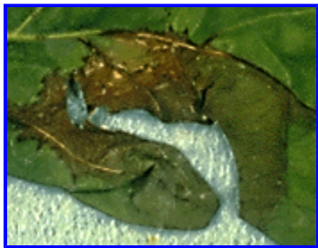
Figure 5. Leaf distortion caused by oak anthracnose lesions.

Oak anthracnose, caused by the fungus Apiognomonia quercina , attacks many species of oaks including bur, white, swamp white, English, pin, northern red, and chestnut oak. Susceptibility varies among species, with white and bur oaks usually the most severely affected.