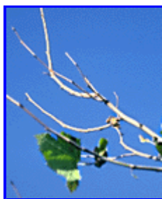
Figure 1. Twig dieback caused by sycamore anthracnose.

Anthracnose diseases affect a wide variety of plants including many popular shade trees. Sycamore, ash, oak, maple, and walnut commonly exhibit symptoms each spring. Although the symptoms may appear serious, anthracnose diseases rarely kill trees. In most cases, healthy trees quickly recover from anthracnose infections with little damage to their long-term health.