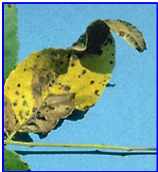
Figure 7. Spotting, yellowing, and premature leaflet drop caused by walnut anthracnose.

Walnut anthracnose is common on black walnut in Nebraska in areas where the weather is often warm and humid. It is caused by the fungus Gnomonia leptostyla .