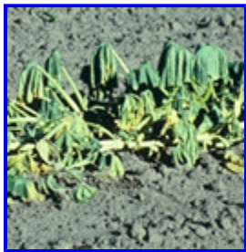
Figure 2. Wilt symptoms caused by squash vine borers.

blossoming and branching. Squash and pumpkin are also attacked by the squash vine borer. The wilting symptoms caused by vine borers may be confused with the initial wilting caused by disease organisms (Figure 2).