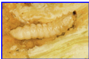
Figure 3. Squash vine borer inside of vine.

The striped cucumber beetle [ Acalymma vittatum (Fabricius)] and the spotted cucumber beetle or southern corn rootworm ( Diabrotica undecimpunctata howardi Barber) are common insects that play an important role in the disease cycle of bacterial wilt. The bacteria may survive the winter in the digestive tracts of these insects which overwinter in the south, or possibly in alternate host plants. As the insects migrate north and become active the following spring, they feed and transmit the bacterium to cucurbit seedlings or transplants.