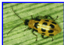
Striped cucumber beetle. Spotted cucumber beetle.