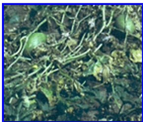
Figure 1. Vines showing bacterial wilt symptoms.

The cucurbit family, which includes cucumbers, muskmelons (cantaloupes), watermelons, squash and pumpkins, is subject to attack by either of two microorganisms that cause diseases known as vascular wilts. These two organisms, one a bacterium and the other a fungus, live and multiply in the water-conducting vessels of the plant. When their numbers increase significantly, the vessels become "plugged," causing plants to wilt and eventually die.