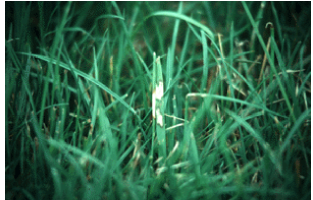
Figure 2. Irregularly-shaped leaf spot of brown patch (right) and bleached leaf spot of dollar spot.

Brown patch occurs on dense, heavily fertilized and watered turf in hot (above 85°F), humid weather when night temperatures remain above 60°F. Poorly drained soils, thick thatch and night irrigation lengthen the period of leaf wetness and promote greater infection. High levels of nitrogen and low levels of phosphorous or potassium may contribute to increased disease severity. Mowing with a dull mower blade frays leaf blade tips and causes excessive wounding that enhances infection through those frayed blade tips.