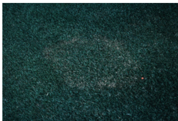
Figure 1. Roughly circular patches typical of brown patch on taller-cut turfgrass.

On home lawns, golf course fairways and similar turfs, field expression of the disease is the presence of roughly circular patches of dead and dying grass ( Figure 1 ). Diseased areas may encompass large portions of the turf. Turf with these patches appears somewhat "sunken." The grass in the center of the diseased patches may be less affected, giving the appearance of the "frog-eye" symptom commonly associated with summer