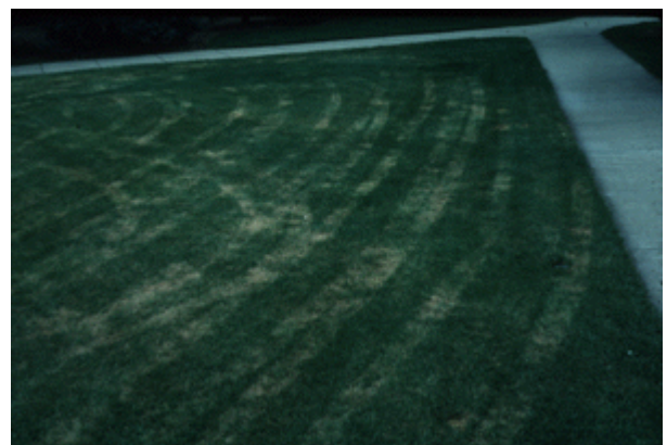
Figure 4. Spread of brown patch by mowing.