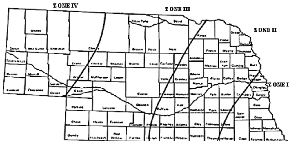
Figure 2. The zones used in making nitrogen recommendations for pastures in Nebraska.

accordingly. Suggested application rates for nitrogen in four large regions of Nebraska are shown in Figure 2 . The lower rates listed for each region are the minimum amounts recommended for average conditions and management situations. Even in years when summer rainfall is below normal, the use of 80 lb of nitrogen per acre usually will increase production economically on pastures and haylands in eastern and northeastern Nebraska. Use the higher rates listed for each zone when there is a full profile of subsoil moisture at the start of the growing season.