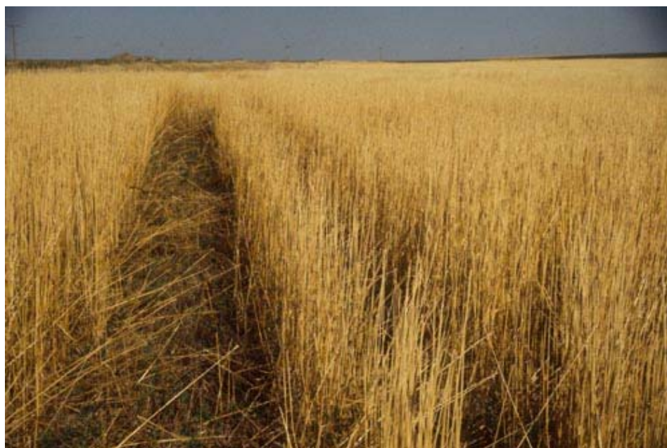
Figure 3. This wheat field south of Sidney, Nebraska was harvested with a Shelborne Reynolds Combine Stripper Header. The use of a stripper header for wheat harvest can leave a tall wheat stubble that provides excellent protection against wind erosion. Additionally, a taller stubble has been found to decrease soil water loss through evaporation, reduce weed infestations, and catch and retain more wind-driven snow in fields where the extra moisture can significantly increase the yield of the following crop.

Another means of increasing silhouette area is to increase the number of stalks in a given area. Be careful not to increase plant density too much or crop performance may suffer. For example, planting rainfed sunflower at too high a population for a given site may result in weakened stalks that break more easily, resulting in a shorter stalk height and reduced silhouette area. Despite their smaller stalk diameter, small grains usually do a better job of reducing wind erosion than crops like corn or sunflower because they have many more stalks per given area ( Table II ).