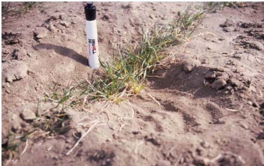
Figure 1. Blowing soil fills seed furrows and partially buries small wheat plants in the spring, resulting in increased plant stress that weakens the plants and makes them more susceptible to further damage by disease and other environmental stresses.

The smallest soil particles, less than 0.004 inch in diameter, are most easily lifted from the soil surface and suspended in the air stream where they may be carried many miles before they fall. Larger soil particles, up to 0.02 inch in diameter, are dislodged and propelled in a bouncing or jumping manner across the soil surface. As they bounce, the force of their impact dislodges other particles from the soil surface and damages or destroys living plants. The bouncing soil particles are responsible for setting in motion other soil particles in an avalanching effect as erosion moves downwind. Still larger particles, 0.02-0.04 inch in diameter, move by rolling on the soil surface.