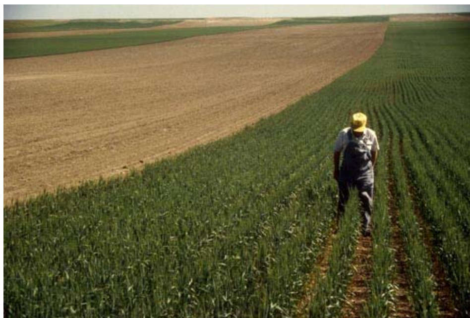
Figure 4. Carl Mortensen, Jr., has found that stripcropping reduces wind erosion and winterkill problems on his Kimball County farm. Soil type is one factor that determines the width of strips. Strips should be arranged perpendicular to the prevailing wind direction.