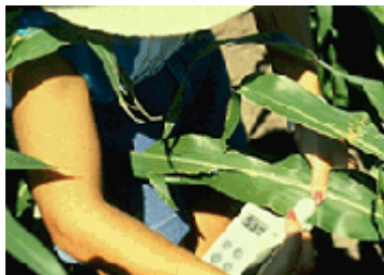
Figure 1. A chlorophyll meter in use.

Researchers have been looking for ways to increase fertilizer N use efficiency. The use of a soil test to adjust fertilizer N rates for residual nitrate works well under Nebraska conditions and producer acceptance of the practice is increasing. However, the potential exists to "fine-tune" N management decisions during the growing season to react to changing weather and crop conditions.