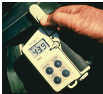
Figure 2. Close-up of chlorophyll meter.

The chlorophyll meter (see Figures 1 and 2 ) has several advantages over other tissue testing methods. A reading that indicates adequate nitrogen (or critical value) is not affected by luxury consumption; a plant will only produce as much chlorophyll as it needs regardless of how much N is in the plant. It is not necessary to send samples to a laboratory for analysis, saving time and money. Producers can sample as often as they choose, and can easily repeat the procedure if they question the results. Using a chlorophyll meter to monitor leaf greenness throughout the growing season can signal the approach of a potential N deficiency early enough to correct it without reducing yields.