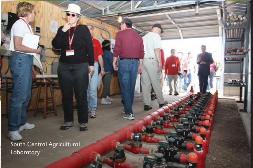
South Central Agricultural Laboratory