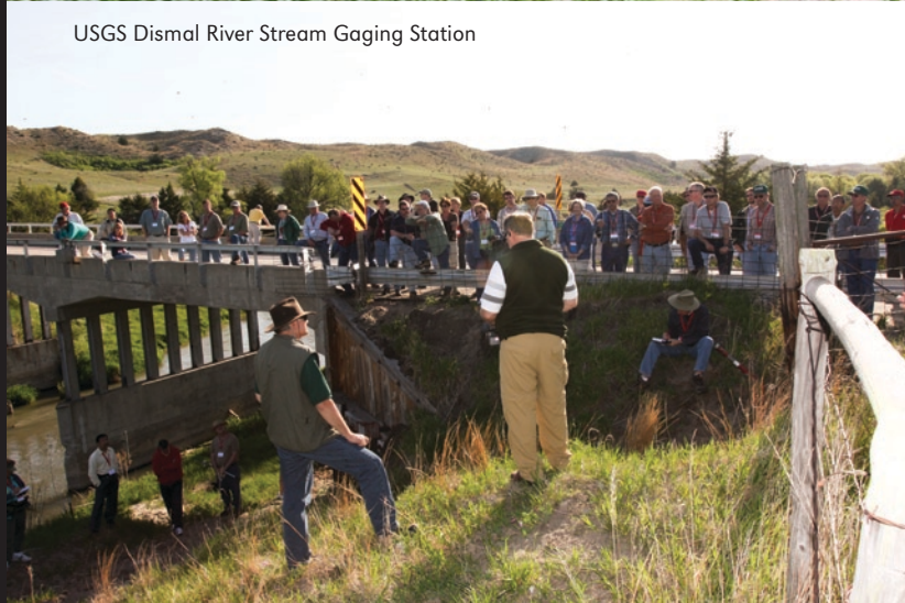
USGS Dismal River Stream Gaging Station