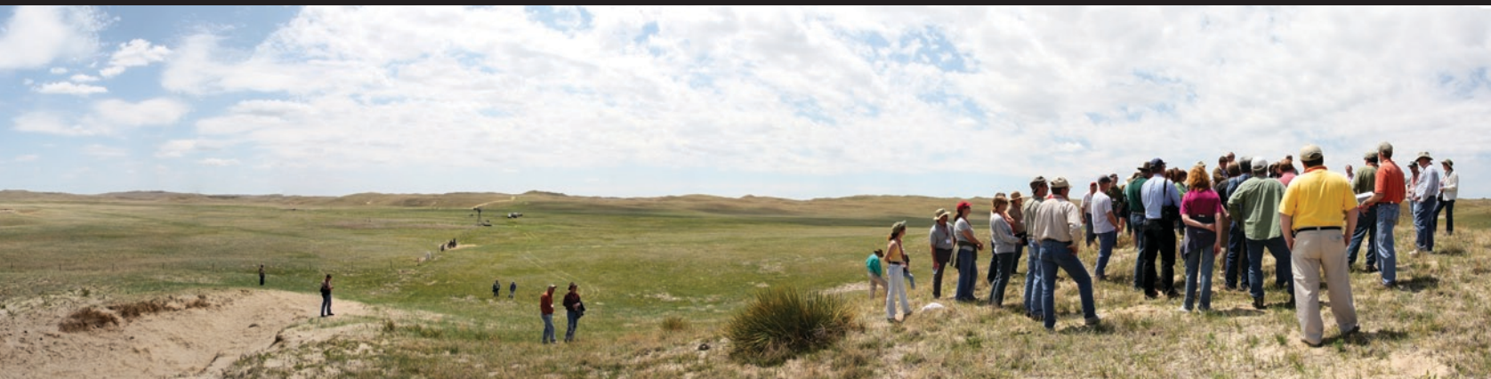
Gudmundsen Sandhills Laboratory