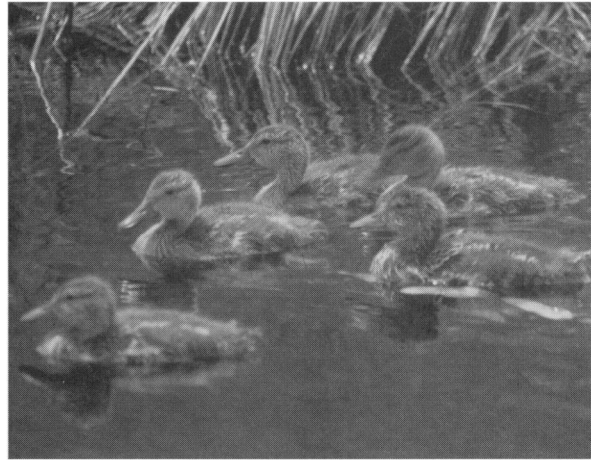
Studies directed at waterfowl species of concern, such as northern pintails (shown here) and lesser scaup, should be a research priority in the northern Great Plains.

Evaluate waterfowl management activities at broad, regional scales. Millions of dollars are spent annually to manage waterfowl, often under management plans written for broad regions—e.g., Prairie Pothole Joint Venture, Prairie Habitat Joint Venture, and North American Waterfowl Management Plan (Williams et al. 1999). However, most management actions are site-specific and are applied at small spatial scales. For greater efficacy, multiple or large-area application of treatments should be considered. Evaluation of large-area management activities comparable to those needed for planning, and possibly for implementation, is difficult and consequently has received little attention (Williams et al. 1999). Evaluation is needed to ensure that management dollars are spent effectively and efficiently. Studies that seek to develop