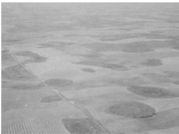
Understanding how landscape factors—such as upland land use and numbers, areas, and types of wetlands in an area—interact to influence demographics and recruitment of ducks was identified as a research priority.