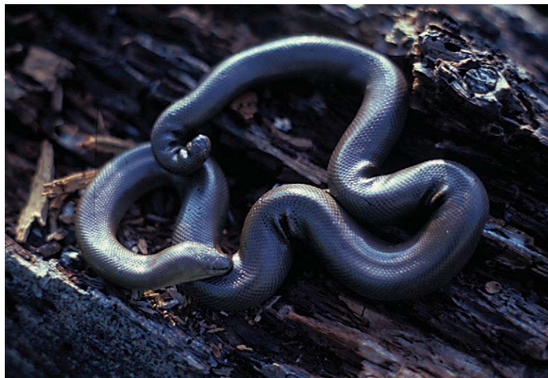
Figure 13 —Rubber boas are a species that may be detrimentally affected by fuel reductions owing to the loss of down logs that they use for cover and foraging.