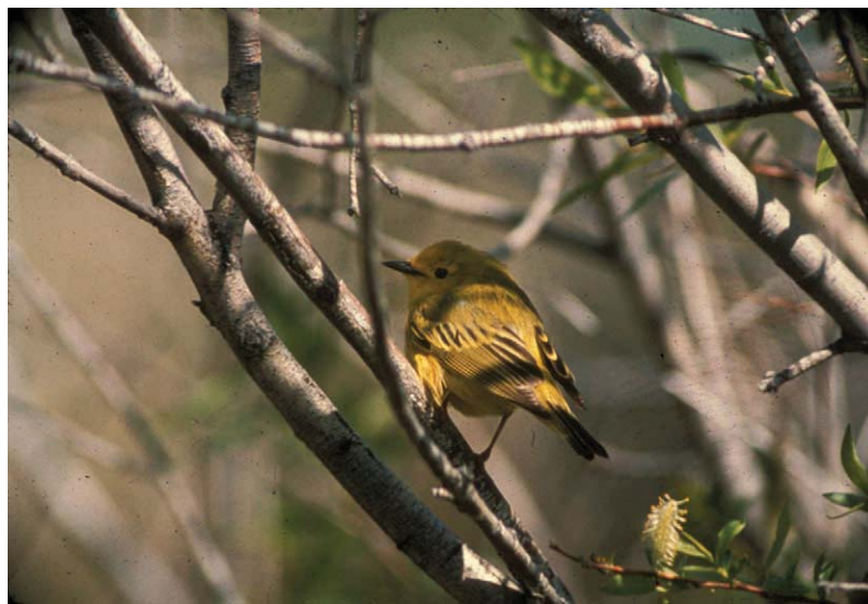
Figure 9 —Yellow warblers will likely benefit from fuel reductions if tall shrubs increase with time.

The reported effects of fuel reduction on birds are not always consistent among studies or species. For example, some studies observe an increase in bird abundance shortly after fuel reduction whereas others report large decreases or no change at all (Huff and others 2005; Moreira and others 2003). Short-term responses may differ from long-term responses (Hannon and Drapeau 2005); breeding bird response may differ from wintering bird response (Bock and Block 2005); and effects observed at the stand scale may differ from those at the landscape or regional scale (Kotliar and others 2002; Saab and others 2002). However, some general effects are fairly predictable. First, thinning or prescribed fires conducted during the nesting season are more likely to result in high mortality of nestlings, especially for species nesting on the ground and in shrubs and small trees (Smith 2000). If conducted prior to the nesting season, prescribed fires are likely to reduce nesting habitat for ground- and shrub-nesting species (Artman and others 2001). Shrubs and ground cover lost during treatment will likely recover within a few years.