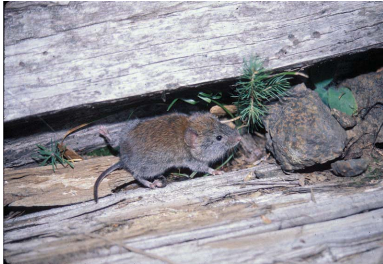
Figure 7 —Red-backed voles may decrease after thinning and fire.

2004), possibly as a result of habitat changes and decreases in truffles, the primary food of northern flying squirrels and other small mammals (Lehmkuhl and others 2004). Lehmkuhl and others (2006) concluded that thinned and burned stands would likely be poor bushy-tailed woodrat ( Neotoma cinerea occidentalis ) habitat in dry forests of eastern Washington due to their association with abundant large snags, mistletoe brooms and soft log cover. In dry mixed conifer