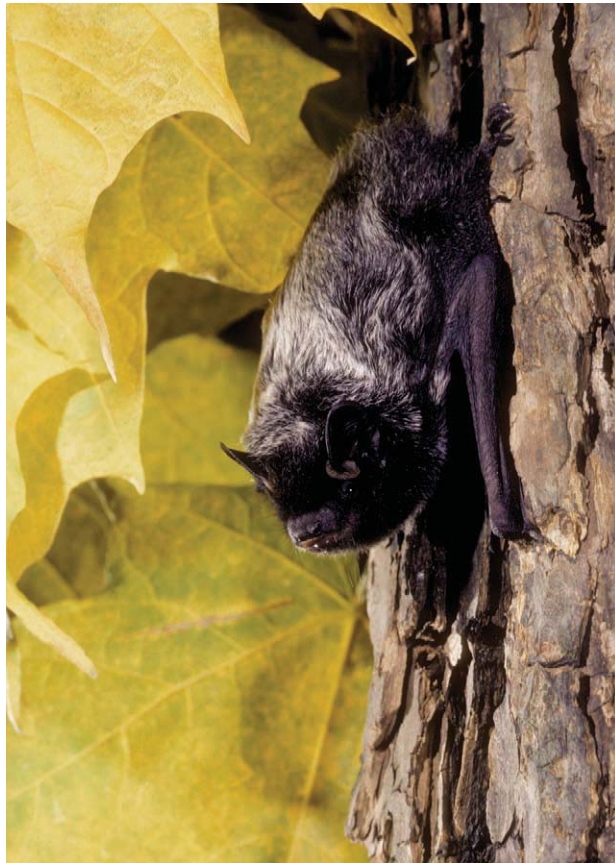
Figure 8 —Silver-haired bats roost under loose bark and in cavities in large trees and snags, habitats that could increase or decrease depending on fuel reduction treatment.

of the site (Boyles and Aubrey 2006; Patriquin and Barclay 2003; Schmidt 2003). However, the loss of these habitat features may be detrimental to forest bat species (Chambers and others 2002). In the Oregon Coast Range, bat activity in Douglas-fir stands was highest in old-growth stands, lowest in unthinned stands of second growth (50 to 100 years old), and intermediate in second growth stands with thinning (Humes and others 1999). Old-growth stands of Douglas-fir-western hemlock, ponderosa pine-sugar pine, and true firs were also preferred by hoary ( Lasiurus cinereus ) and silver-haired bats compared to younger stands in other parts of Oregon (Perkins and Cross 1988). Bat activity was higher in old growth stands of Douglas-fir than in mature and young stands in the southern Washington Cascades and in the Oregon Coast Range (Thomas 1988). The preference for old growth may be a function of the high density of large-diameter snags used as roosts; the open space between trees, which allows bats to gain flight when leaving the roost; or other factors. It is not known if stands with fuel reductions will function in the same capacity throughout the interior dry coniferous forests of the West.