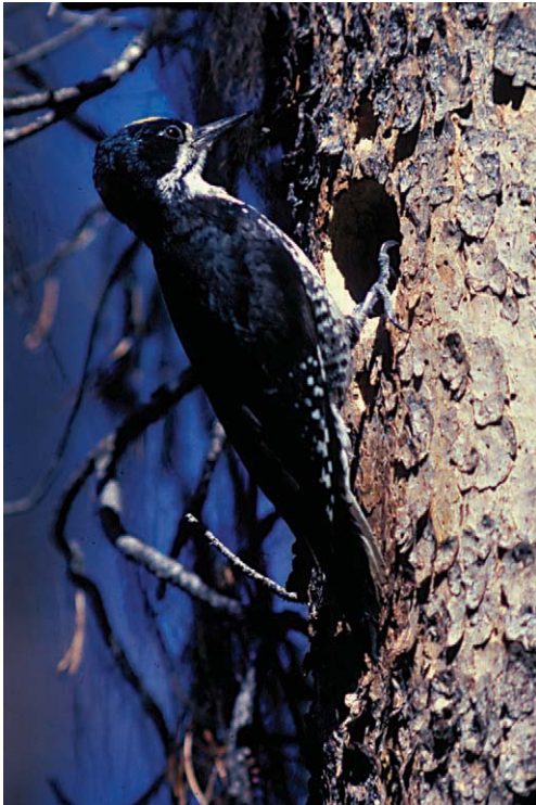
Figure 12 —Black-backed woodpeckers move into burned areas to forage on bark and woodboring beetles that invade the scorched trees.

Maintaining a minimum number of snags per hectare in a ponderosa pine or Douglas-fir stand may be insufficient given the ephemeral nature of snags (in other words, continually changing in height, decay state, and presence of sapwood decay organisms) (Parks and others 1999; Zack and others 2002). Wildfire research in dry forests in Idaho suggests that cavity excavation increases with time since fire, but that most cavities are only used once by seven of the eight woodpecker species that were considered (Saab and others 2004); thus a continual supply of snags is needed to maintain new nesting sites over time.