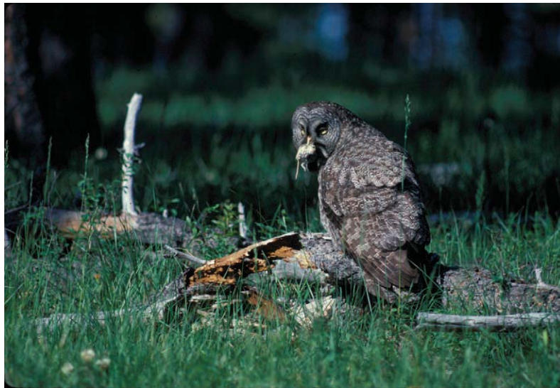
Figure 10 —Great gray owls may benefit from the more open forest structure resulting from fuel reductions, but the loss of nest sites in large-diameter snags and mistletoe brooms would be detrimental.

Prescribed fire can also alter bird foraging habitats and the primary components of bird diets, such as insect populations and fruit production of plants (Dickson 1981). Any fuel-reducing activity that removes a bird's preferred foraging habitat will likely result in adverse affects, at least in the first few years after treatment. For example, tree gleaners declined after thinning in an Idaho ponderosa pine-Douglas-fir forest (Medin and Booth 1989). A potential increase in food supply (seeds and insects) following fire might provide better foraging for these birds because there is greater access owing to the removal of grass layers. This increase in food supply influences mostly granivorous species and some omnivorous and carnivorous species that feed on the ground (Artman and others 2001). Burn edges can also be important for some birds by providing a heterogeneous mix of burned and unburned trees, possibly providing opportunistic foraging while maintaining cover from predators. Hence, the juxtaposition of live and dead trees may be important for some species such as the olive-sided flycatcher (Altman and Sallabanks 2000; Kotliar and others 2002).