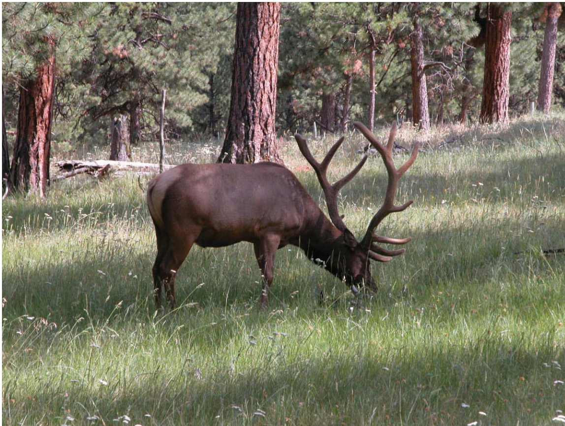
Figure 5 —Fuel reductions usually increase the amount of forage for ungulates.

For centuries, Native Americans and land managers have used prescribed fire to improve habitat for ungulates, and it is generally agreed that prescribed fire improves the quality of browse vegetation (Bentz and Woodard 1988; Easterly and Jenkins 1991; Riggs and others 1996). In an aspen stand in Idaho, a prescribed fire greatly improved the amount and nutritional quality of forage for elk within one to two years after prescribed fire (Canon and others 1987). This finding is consistent with deer and elk responses to recovering vegetation after wildfire. For example, one year after a wildfire in Idaho, mule deer ( Odocoileus hemionus ) preferred the burned Douglas-fir/ninebark and burned ponderosa pine/bluebunch wheatgrass habitat types compared to unburned areas (Keay and Peek 1980). Although Keay and Peek (1980) found that white-tailed deer ( Odocoileus virginianus ) preferred unburned forests because of their preference for dense cover, white-tailed deer in a ponderosa pine forest in the Black Hills of South Dakota selected recently burned winter range (DePerno and others 2002), and this preference for burned habitats has been reported in other forest types as well (Main and Richardson 2002). White-tailed deer may be more likely to use treated stands if patches of dense cover are retained.