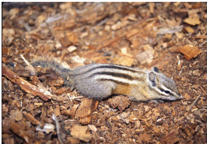
Figure 6 —Chipmunks typically flourish after disturbance events like thinning and fire.

Some species of small mammals prefer high canopy closure and thus may be adversely affected by thinning treatments. For example, the Abert squirrel ( Sciurus aberti ) in ponderosa pine forests in north-central Arizona selects areas with high overstory canopy (Dodd and others 2003). Thinning will likely have a drying effect on high-canopy, high-density stands of grand fir (Lillybridge and others 1995), potentially having a negative effect on northern flying squirrel ( Glaucomys sabrinus ) populations (Lehmkuhl and others 2006). Northern flying squirrel abundance in dry Douglas-fir-ponderosa pine-western larch forests in northeastern Oregon decreased one to two years after a thinning treatment (Bull and others