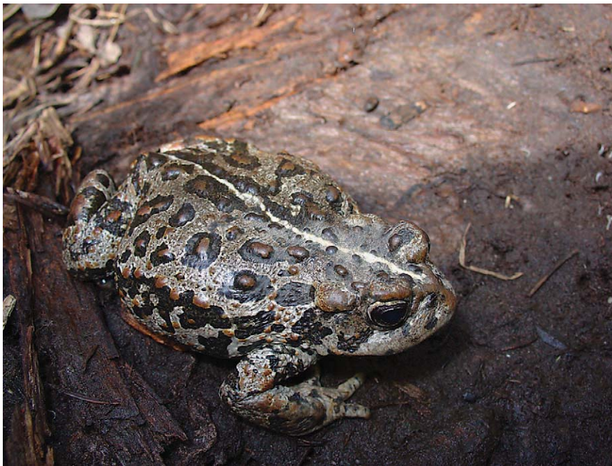
Figure 14 —Boreal toads readily occupy burned habitats, foraging on ants and ground beetles and finding shelter under logs and rocks and in rodent burrows.

The effects of prescribed fire on amphibians is highly variable and strongly influenced by the location of fires in proximity to breeding habitats (generally wetlands), season of fire, and amphibian species (see reviews by Bury 2004; Bury and others 2002; deMaynadier and Hunter 1995; Pilliod and others 2003; Russell and others 1999). To date, few studies have been published on the effects of prescribed fire on amphibian populations in dry coniferous forests of the West (see table 1 in Pilliod and others 2003). Comparing amphibian populations before and after logging and burning of activity fuels in western Oregon, Cole and others (1997) found that capture rates of terrestrial Ensatina ( Ensatina eschscholtzii ) and giant salamander ( Dicamptodon tenebrosus ) decreased in treatment stands relative to untreated controls. In contrast, Vreeland and Tietje (2002) found similar abundances of slender salamanders ( Batrachoseps attenuatus ) in California oak woodlands before and after prescribed fire.