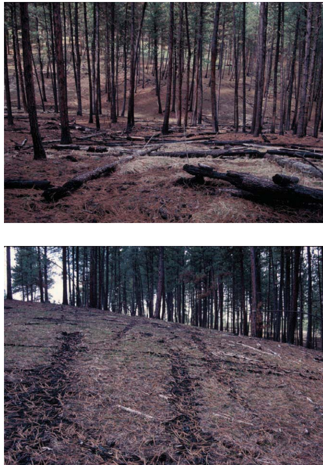
Figure 2 —An example of a prescribed fire that resulted in the retention of down wood providing cover for small mammals and foraging substrates for black bears and pileated woodpeckers (top). An example of a prescribed fire that resulted in a loss of all down wood (bottom).

others 1998). Whereas spring burns may remove grasses and shrubs that provide critical forage and cover for small mammals, birds, ungulates, and invertebrates, late summer and fall burns remove senescent plant biomass and usually stimulate growth of grass and shrubs the following spring (Mushinsky and Gibson 1991; Potter and Kessel 1980). Some spring burns are conducted prior to green-up and many grasses, forbs, and some shrubs will sprout or resprout within a few weeks of a spring fire. Fall fires tend to burn hotter and consume more of the down wood and snags. Stands generally have a range of tree sizes, and it is the smaller diameter trees that will most likely be killed by prescribed fire. These dead trees may provide temporary foraging habitat for some species, such as bark and wood-boring beetles and woodpeckers that feed on them, but these trees are usually too small for nest cavities. Mortality of live trees tends to be less with spring burns than with fall burns owing to higher moisture content in spring. Consumption of large logs by fire is regulated by fuel moisture, which is often higher in spring and may minimize the loss of these important habitat elements compared to fall burns.