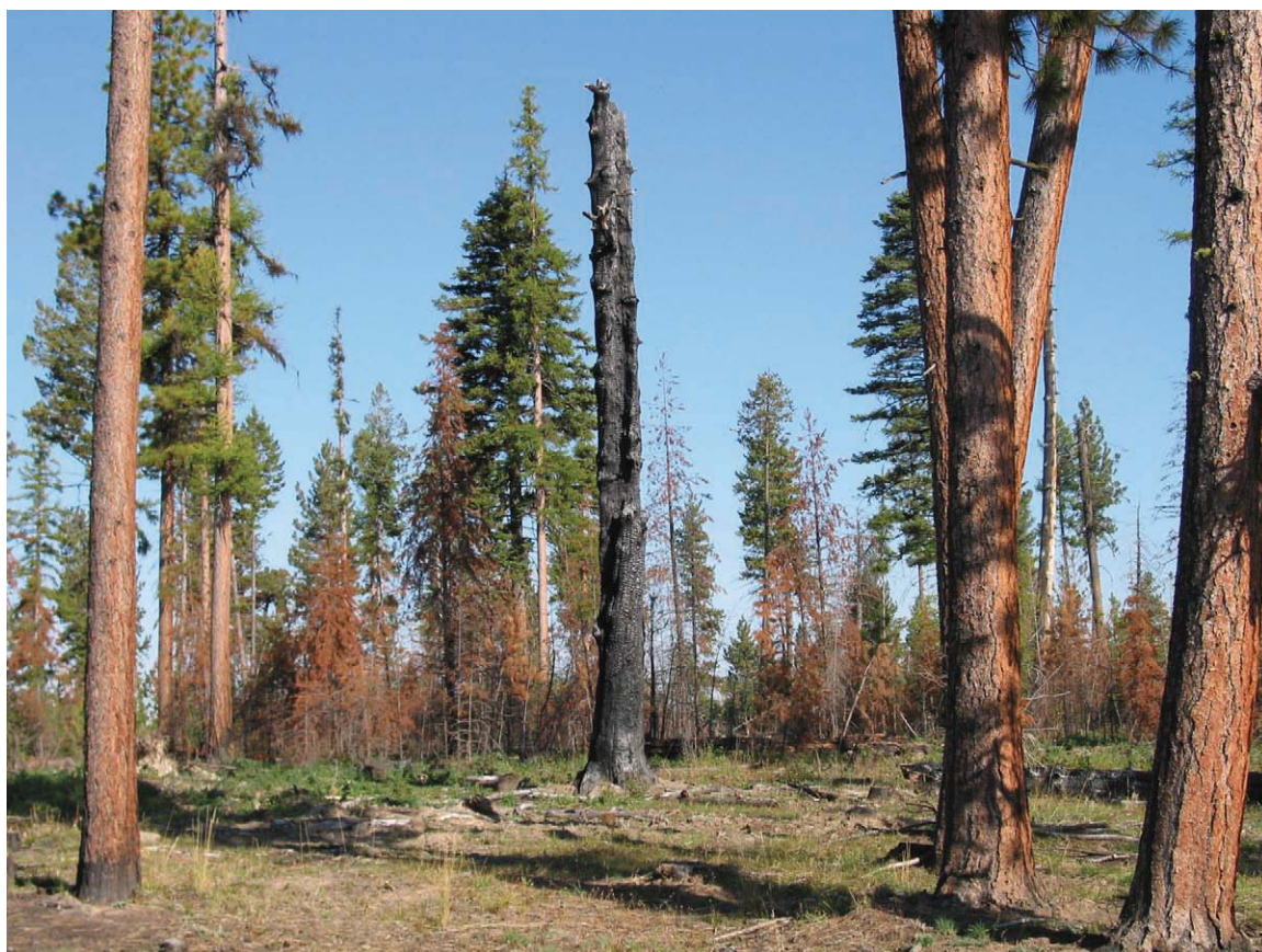
Figure 3 —Snag previously used as a nest/roost for pileated woodpeckers inadvertently burned during prescribed fire.

Implementation of any thinning or prescribed burning is likely to result in loss of snags, future snags, and down wood that are important stand attributes of healthy forests and critical components of wildlife and invertebrate habitat (fig. 3). The retention and protection of snags during treatments could minimize the effects of fuel reduction treatments on cavity-dependent wildlife, and retaining some down wood in treated stands could minimize negative effects on species that depend heavily on this habitat structure. Loss of large-diameter snags and down wood can take years to decades to recover, as indicated by wildland fire research (Passovoy and Fule 2006). The Healthy Forest Restoration Act (2003) directs “to maximize the retention of large trees,” although it is unclear if this includes both live and dead trees.