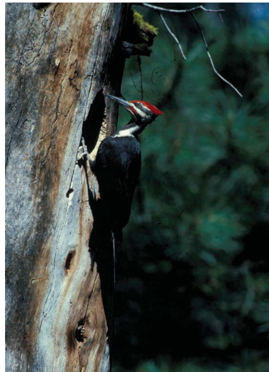
Figure 11 —The loss of down wood and snags in fuel reductions would be detrimental to pileated woodpeckers.

Prescribed fire results in variable snag creation and loss across a stand. Finch and others (1997) reviewed studies that evaluated the effects of prescribed fire on snags and down wood in southwestern ponderosa pine forests and found that snag loss was greatest in the large size classes and in the decay classes (those with decayed heartwood) that contained nest cavities. Snag loss typically ranged from 20 to 48 percent and