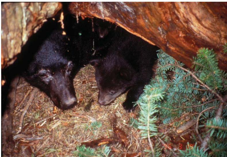
Figure 4 —Thinning and prescribed fire will likely increase the amount of grasses and berries used by black bears for foraging but may decrease the amount of hiding cover, den sites in hollow logs, and down wood used for foraging on ants and wasps.

Fuel reduction may decrease the amount of escape cover, which may be the most critical component of black bear habitat (Hamilton 1981). Sites used by black bears for traveling and resting typically have high stem density and dense canopy closure, presumably for security (Bull and others 2001a). A radio-telemetry study of 14 black bears in the ponderosa pine and mixed conifer forests on the Mogollon Rim in north-central Arizona found that horizontal cover was important for feeding and particularly bedding sites, and that only 12 percent of bedding sites were in areas that had been selectively logged or thinned in the previous 20 years (Mollohan and others 1989). Bears use large-diameter hollow logs for denning (Bull and others 2000) that may be consumed in prescribed fires (fig. 4) or by thinning operations.