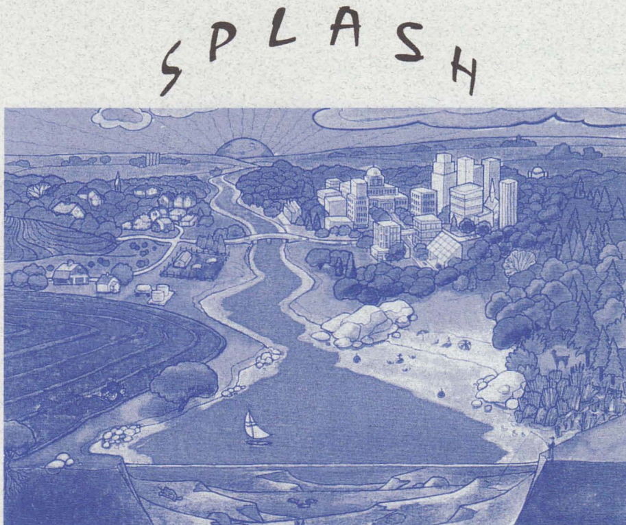
One of the many colorful and interactive teaching screens in "Splash," a CD-ROM game on nonpoint source pollution. The game will be pilot tested and should be ready for distribution later this year.