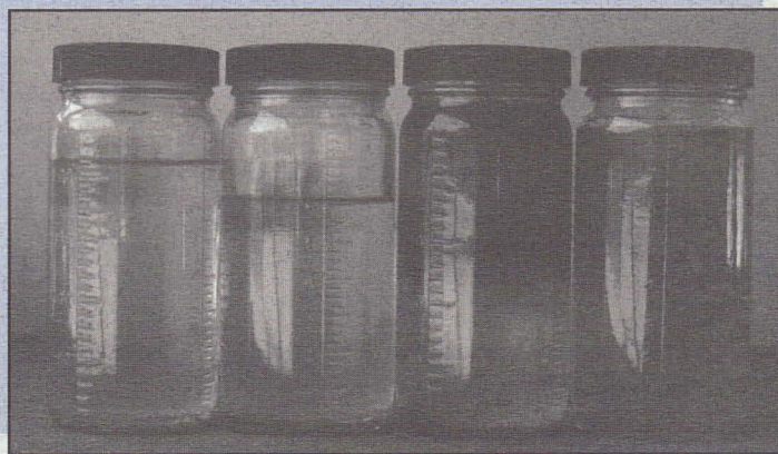
Seeing is believing. Jars of water taken from groundwater-fed sandpit lakes near Fremont show how treating the water with aluminum sulfate can help eliminate blue-green algae by removing the phosphorus it feeds upon. The treatment can improve water clarity by more than 130 percent according to NU aquatic researchers.

"Initially it's more expensive to apply than copper sulfate....about $500 per surface acre....but it's far more