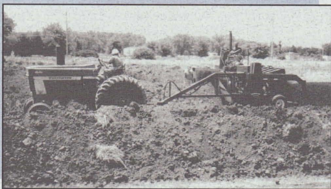
A tractor pulling the "Microenfractionator" mixed the bulk soil three times as a step in the decontamination process. NU researchers successfully used this method to substantially reduce metolachlor concentrations from soil in a waste lagoon in southwest Nebraska.