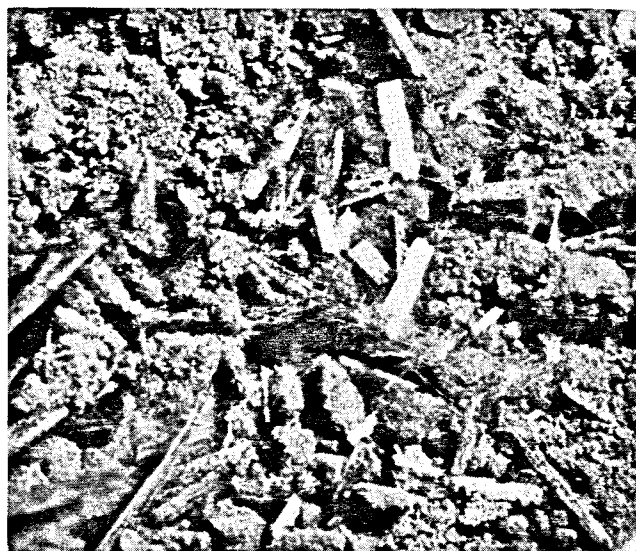
FIG. 2.—A portion of the inoculated plate shown in figure 1 magnified 5 times. Note the mycelial growth on the particles of straw and Peorian loess.

effective in aggregating Peorian loess. Except as noted, the following conditions were used in all experiments: carbon source—ground wheat straw, 1% concentration; initial moisture level—25%; incubation temperature—24° C.; incubation period—2 weeks. Thirty-five gm. of Peorian loess was used in each of triplicate Petri dishes, and duplicate aggregate determinations were made from each dish. The following variables were studied: incubation time, incubation temperature, moisture level, nature and concentration of carbon source.