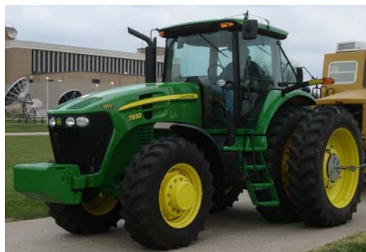
JOHN DEERE 7930 IVT DIESEL

Institute of Agriculture and Natural Resources University of Nebraska—Lincoln