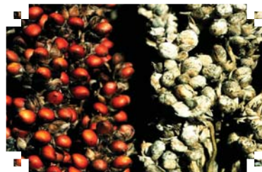
Grain mold resistant sorghum at left