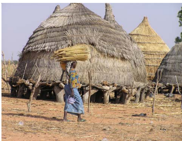
Traditional granaries in Niger

In addition to the increased yields due to the use of new technologies, the farmers following the project recommendations also received higher prices for their grain. Why were they able to obtain higher prices for