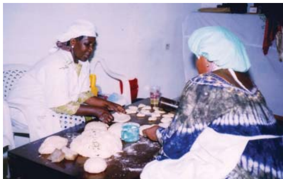
Training participants making chapatti dough in Dar es Salaam