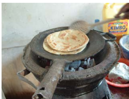
Chapatti cooking on a charcoal grill

“From our experience in Tanzania we anticipate an ever increasing number of sorghum-based food product businesses in East Africa, many of which are managed by women, who will then be able to increase their family’s standard of living.”