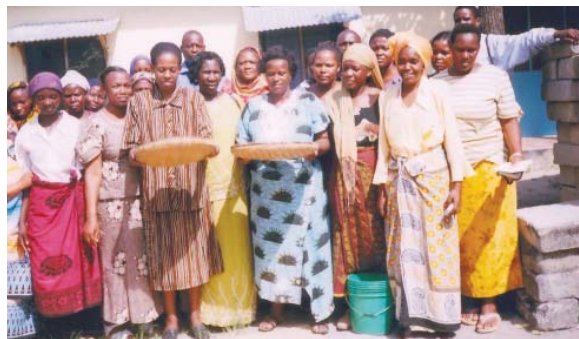
Members of three Tanzanian women's groups admiring sorghum buns baked during a training session in Dar es Salaam

The research portion of this project is targeted toward grain quality/product development issues that can be directly applied to improving U.S. sorghum quality as well as developing new prototype sorghum products applicable for U.S. consumption and export markets. This will include improvement in the quality of sorghum used in food products made for individuals with wheat intolerance and for sorghum-based snack foods that are shipped to Asian countries and will improve the quality of sorghum and pearl millet starch used for ethanol production.