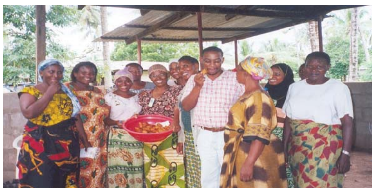
Dar es Salaam training participants tasting sorghum-based buns