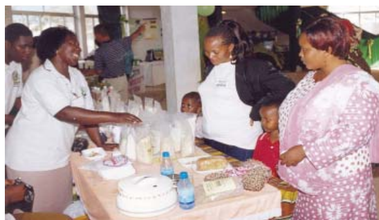
Sorghum and pearl millet-based food products on display at a food fair in Tanzania