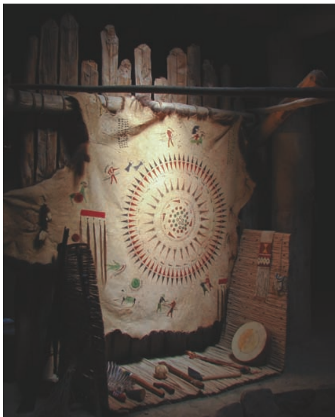
Native American art and tools.

The National Preservation Institute is a nonprofit organization that offers seminars to enhance the skills of professionals responsible for the preservation, protection, and interpretation of historic, archeological, architectural, and cultural resources. See the full range of NPI courses online at www.npi.org or contact Jere Gibber at 703/765-0100 or info@npi.org . ♦