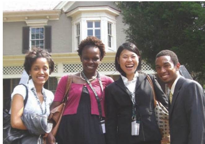
Four of the 2008 CRDIP Interns pose in front of the Frederick Douglass National Historic Site during their visit to Washington, DC for the three-day Career Workshop in August 2008.