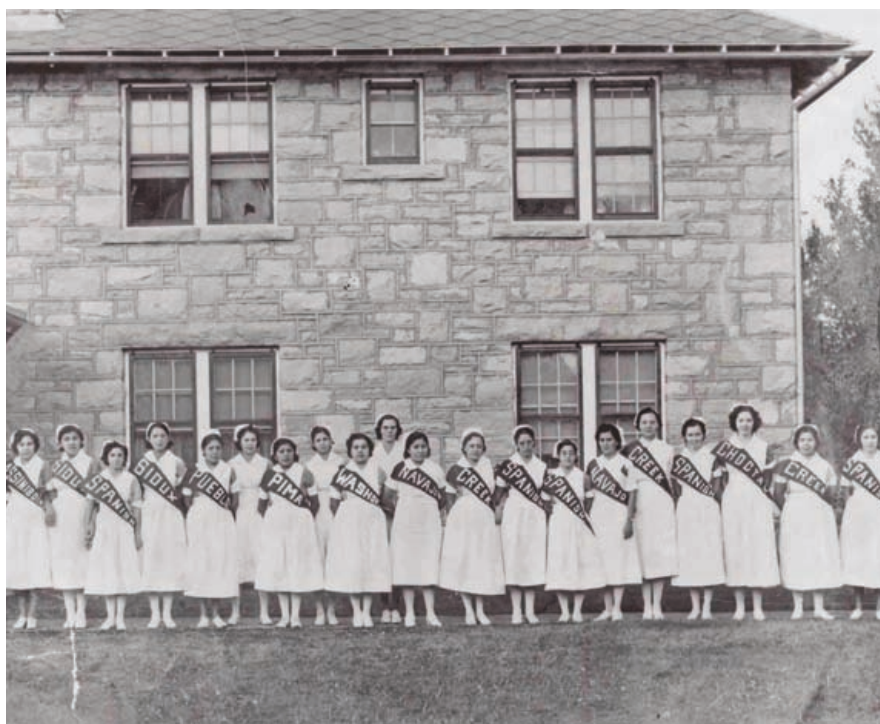
Nurses wearing sashes that indicating their ethnicity, pose in front of the Nurses Home for Sage Memorial Hospital School of Nursing, circa 1940.