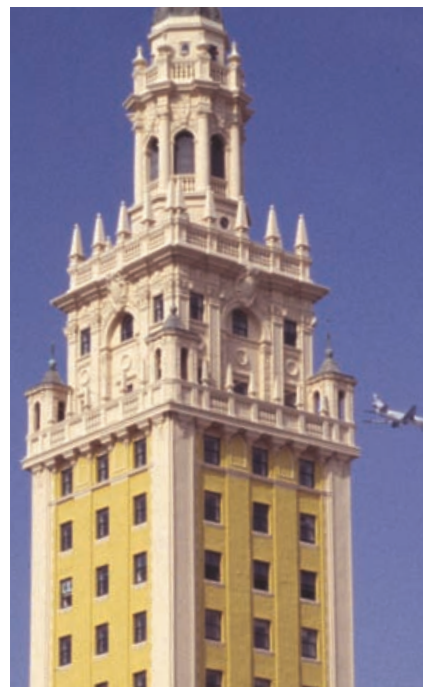
Designated a National Historic Landmark on October 6, 2008, Freedom Tower served as a place of refuge for Cuban immigrants to the United States from 1962 to 1974.

In addition to its significance to immigration history, Freedom Tower's architecture is also worth noting. The building was the home of the Miami Daily News and Metropolis from 1925 to 1957. Designed by Leonard Schultze and S. Fullerton Weaver, the building is designed in the Mediterranean Revival style, an adaptation of Spanish Colonial architecture particular to South Florida, detailed with Spanish Baroque treatments. The interior reflects Florida's role in the "new world" explored by Spain, with a mural of the Western Hemisphere and tiles from Spain, Cuba, as well as South America and Africa. Freedom Tower was designated an NHL on October 6, 2008.