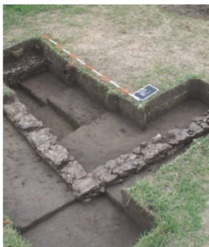
Excavations of the New Philadelphia Town Site outside of Barry, Illinois, provide an understanding of a multi-racial community at a time when such places were rare.

New Philadelphia provides material evidence for understanding life in multi-racial communities of the era. At New Philadelphia, researchers have an opportunity to investigate both the relationships of formerly enslaved individuals, free born African Americans, and people of European descent who lived together in a small rural community, and the effects of interaction between the groups. Archeological analysis at New Philadelphia reflects new trends within historical archeology that seek to understand how material culture and racial identity interact. The site was designated an NHL on January 16, 2009.