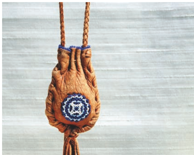
Native American medicine bag.

The initial workshops for Writing and Managing a Successful Grant are scheduled for May 20–21 in Seattle, Washington, and September 15–16 in Chicago, Illinois. The first Determining Cultural Affiliation workshop will be held on September 14 in Chicago, Illinois. Each will be offered twice a year. Tribal representatives are eligible for a scholarship to cover registration for either workshop. Small museums may receive a scholarship for the Determining Cultural Affiliation workshop. Registration and scholarship information is online at www.npi.org or www.nps.gov/history/nagpra .