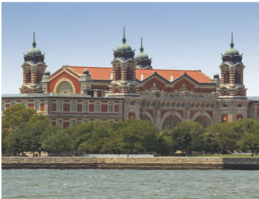
The immigration museum on Ellis Island, New York