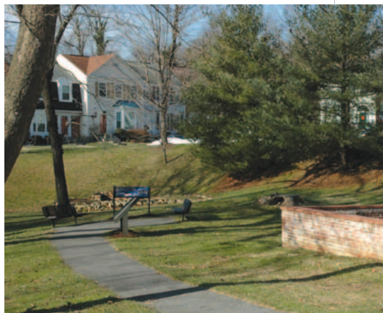
Reconstructed Wooden Frame and Brick Quarters Foundations, Courtesy of the Maryland-National Capital Park and Planning Commission, Archaeology Program