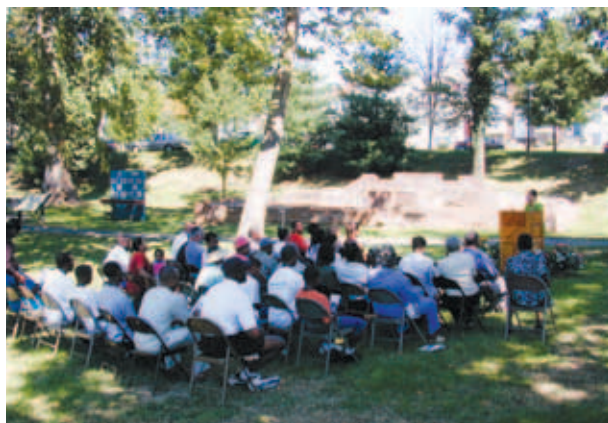
Family Memorial Service

The archeology and accompanying oral histories, combined with documentary research provide preservation efforts at Northampton Plantation with valuable information on African American home life during and following slavery. ♦