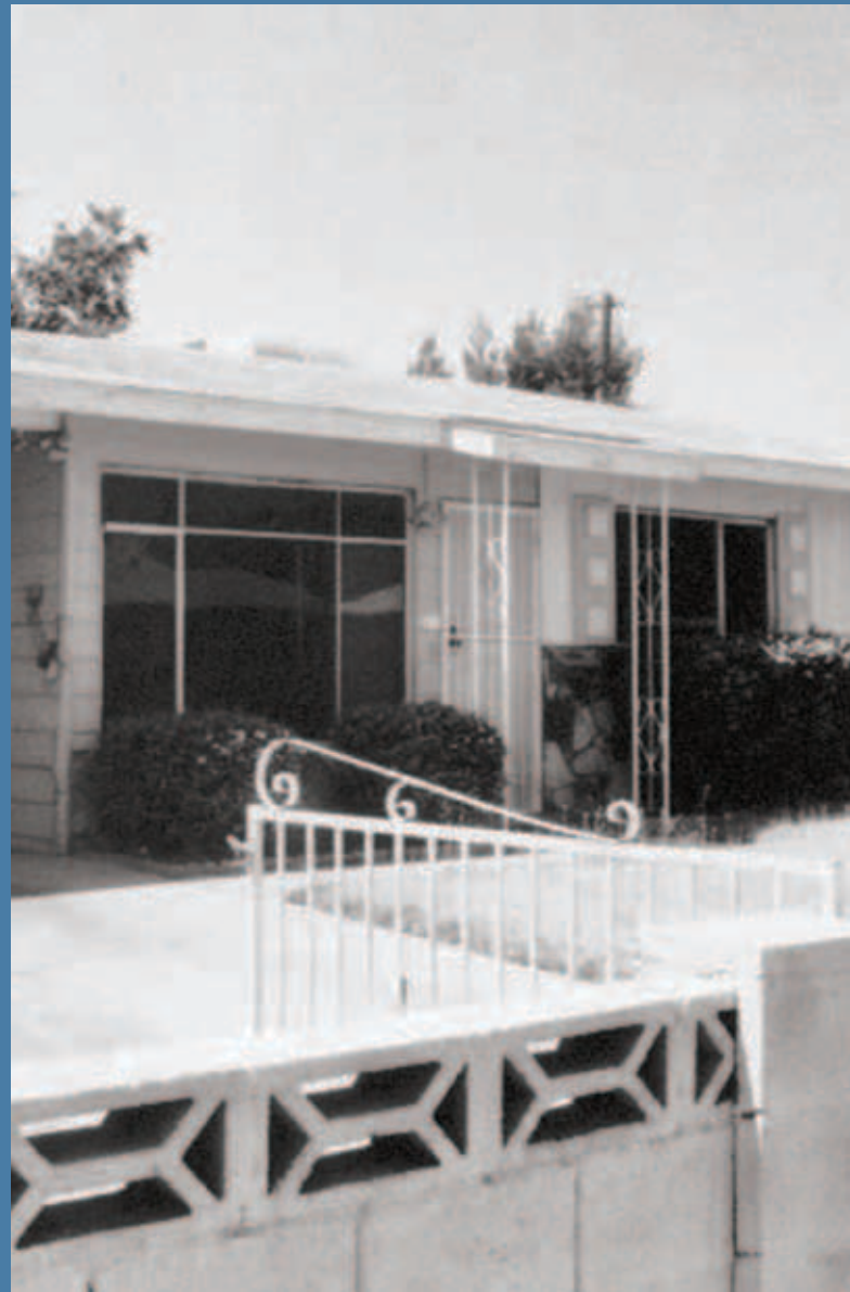
An African American community designed by Paul R. Williams, Berkley Square was the first planned community designed by a minority architect in the state of Nevada.

Berkley Square represents the strides made by the African-American community in the period of activism leading up to the Civil Rights Act. It provided quality housing and services to Las Vegas' historically neglected Westside. It is still a predominately African American community, and many homes have been kept within the families that originally purchased them when they were constructed in the 1950s. Berkley Square was listed in the National Register of Historic Places on October 23, 2009.