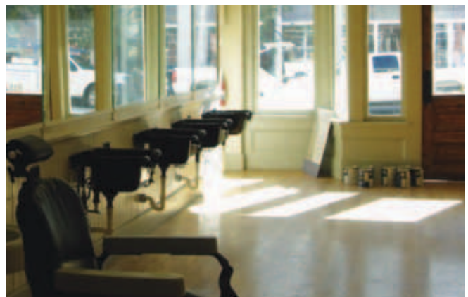
The rehabilitation of the historic Odd Fellows Building included the retention of the Capitol Barber Shop. Even the vintage barber chair and sink remain.

Not only were historic features preserved, such as original board ceilings and a vintage barber chair and sink, but the developers also retained the Capitol Barber Shop, one of the anchors of the community, as a tenant.