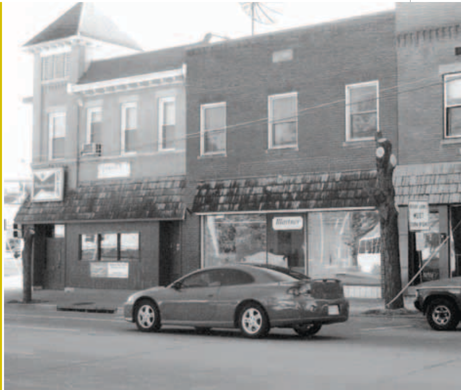
The German community of Munichberg Historic District in Jefferson City, MO, dates back to the late 19th century.