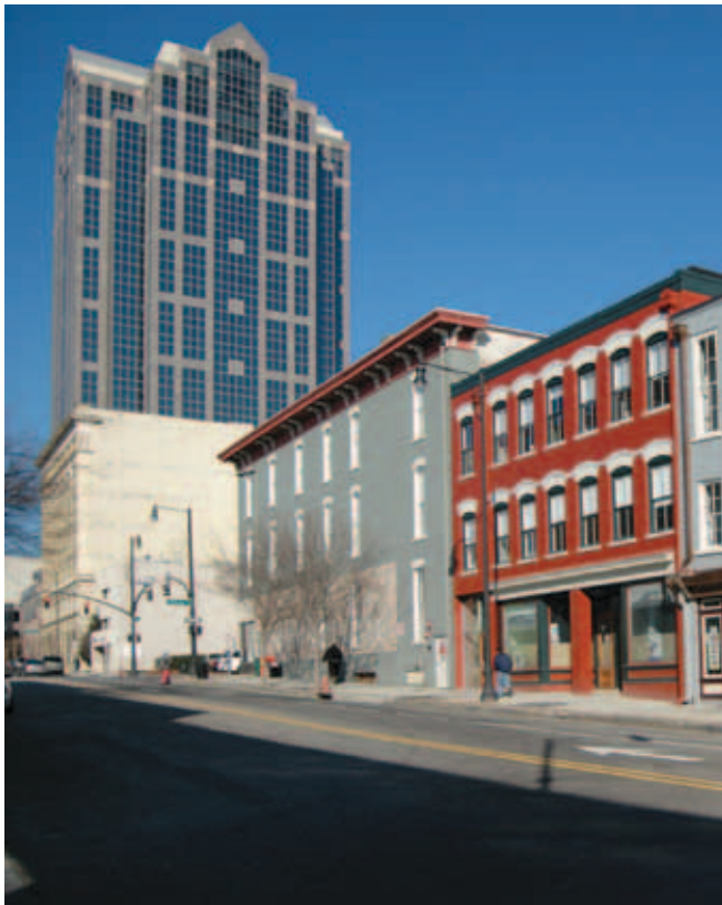
Many of the buildings along the Black Main Street in Raleigh have been rehabilitated, breathing new life and economic growth into this part of North Carolina's capitol city.

Not only were historic features preserved, such as original board ceilings and a vintage barber chair and sink, but the developers also retained the Capitol Barber Shop, one of the anchors of the community, as a tenant.