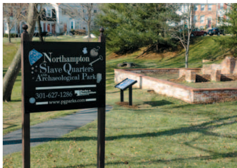
Northampton Slave Quarters and Archaeological Park

The second structure was constructed in the 1840s and also housed two families. It was built entirely of brick (22 feet by 40 feet) and divided into two living areas by a central wall