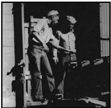
Navy enlisted men unload ordnance at Port Chicago Naval Magazine before the disaster. See page 2.

After the explosion, in a highly publicized Navy trial, 50 black