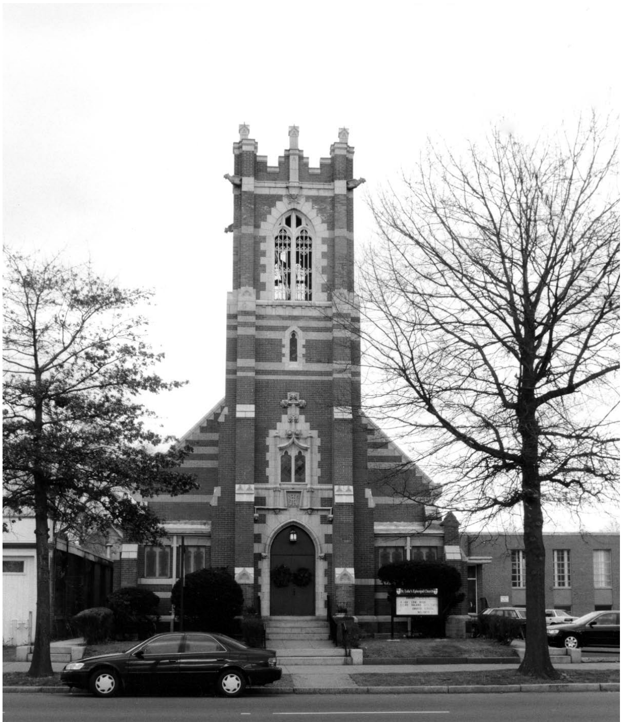
The St. Luke's Episcopal Church in New Haven, CT, is exemplary of late Gothic Revival architecture.

and visitation for parishioners in need. Outreach extended to the New Haven community included providing educational and social services, making it a valuable community asset.