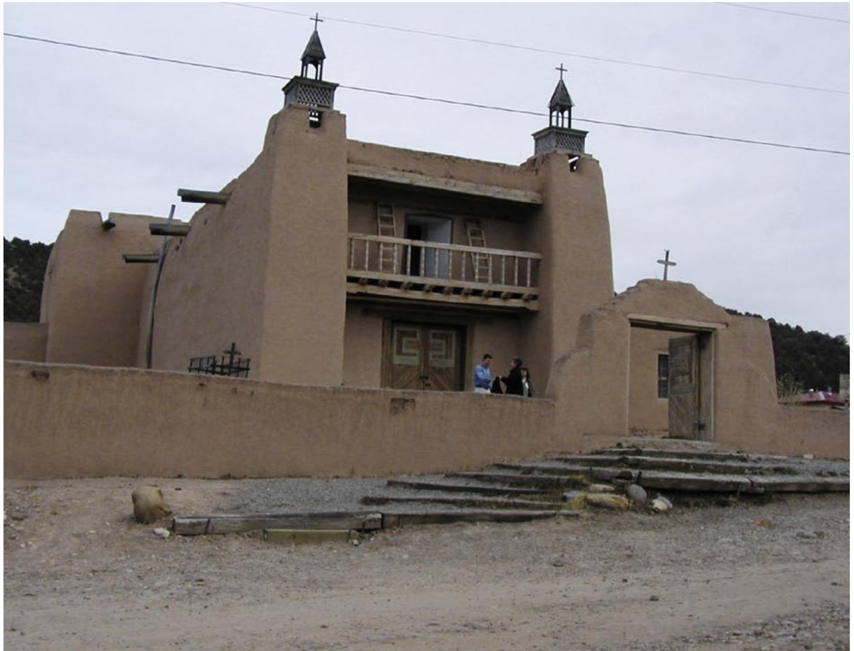
San José de Gracia de Las Trampas is one of the resources that make up the Northern Rio Grande Heritage Area.

Pueblo tribes and the descendants of Spanish settlers who arrived in 1598. These groups made up the early population of the region. The national importance of this region lies in a combination of physical features, such as the Rio Grande and surrounding natural landscape, and the Indigenous cultures, languages, folk arts, customs, and architecture. These resources are in need of research and documentation, preservation, and comprehensive interpretation. Local governments and residents actively support national heritage area designation as a mechanism for encouraging these activities and managing increased levels of heritage tourism, which would benefit the region economically