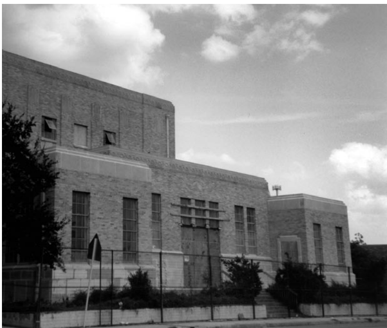
The Carver Library and Auditorium has served the San Antonio, TX, African-American population since 1929. The inset shows the original name of the library, "Colored Branch of the San Antonio Library and Auditorium."