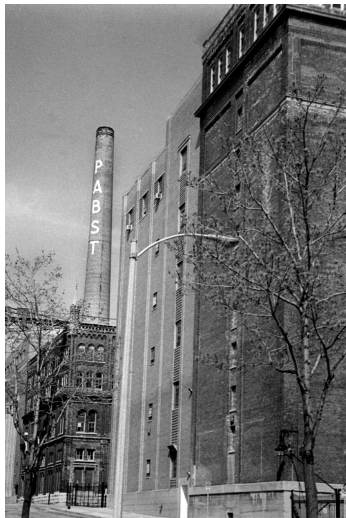
The architecture of the Pabst Brewing Complex reflects the German cultural heritage associated with the lager brewing process and the German immigrant community in Milwaukee, WI.