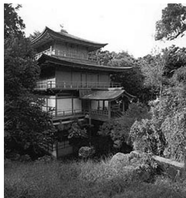
The Kinkaku-ji Temple in Honolulu, HI, was designed according to Japanese architectural traditions.