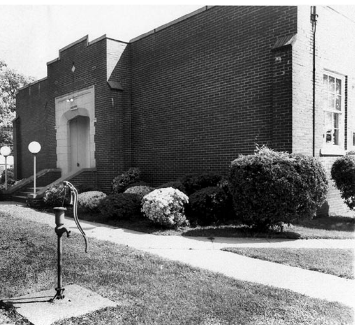
Formerly a high school for the Rockville African-American community, Lincoln High School now serves as a school board administrative building and is leased to other nonprofit organizations.

LPPP's next step is to document the demographic shift in the community since the mid-1980s, when increasing numbers of Latino, Asian, and other immigrant groups began arriving, attracted to its convenient public transportation and affordable housing. LPPP is collaborating with the city of Rockville to commemorate Lincoln Park's history and allocate resources to continue documenting the community. LPPP and others are also working to nominate the Lincoln Park community to the National Register of Historic Places.