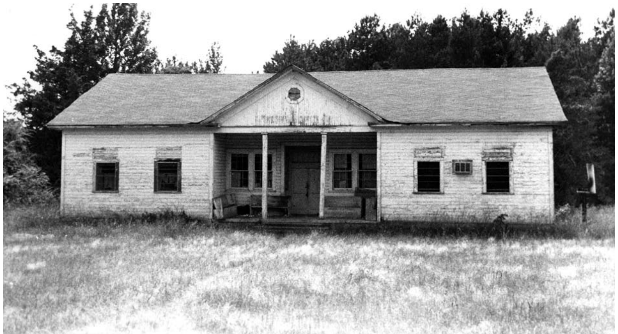
The Mt. Olive Rosenwald School was once a social and cultural hub in the African-American community in Bradley County, AR.

Native American groups, including the Choctaw, Creek, Seminole, and Chickasaw.