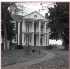
Vann House, connected to the Cherokee Trail of Tears in Georgia, was recently listed in the National Register. See page 7.