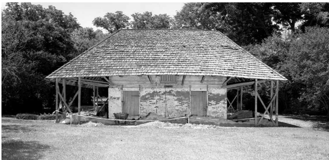
(Right) Stunning in its appearance, the Africa House at Melrose Plantation reflects the cultural continuity between enslaved African Americans and their West African antecedents.