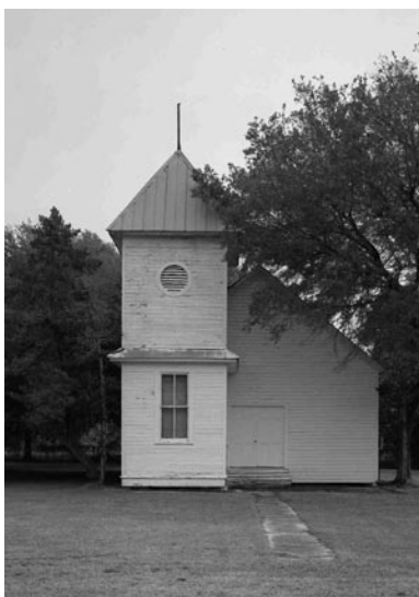
(Left) St. Charles Chapel, in Natchez, Natchitoches Parish, sits just across from Beau Fort Plantation and served the Bermuda community after its dedication in 1910.