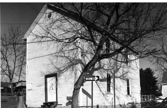
(Left) Odd Fellows Hall once served as a meeting hall for the African American community, Blacksburg, Virginia, during the first half of the 19th century.