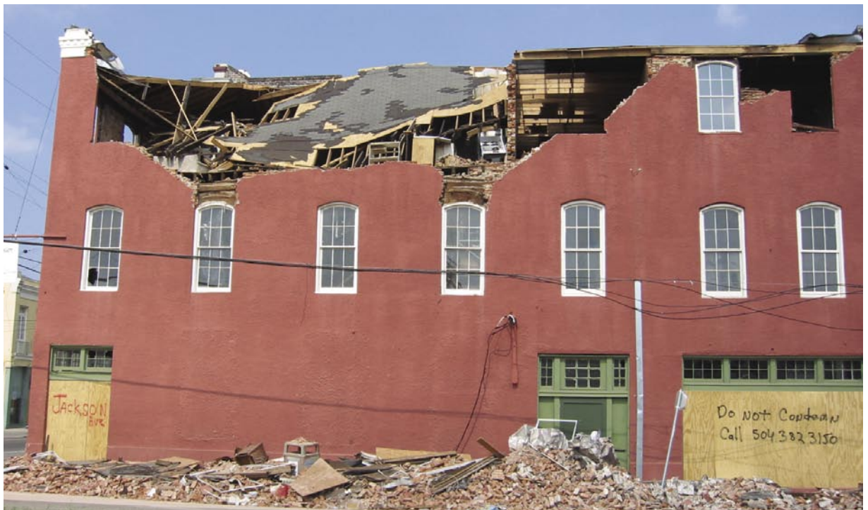
This historic commercial building at the corner of Jackson Avenue and Magazine Street in the New Orleans Garden District illustrates the severe damage caused by both wind and water during Katrina. African American-owned properties were particularly hard hit throughout the Gulf Coast.