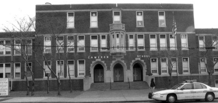
(Below) Cameron is one of two African American schools built in Nashville, Tennessee, as part of Roosevelt's New Deal Era programs.

and died in service to his country. It stands as one of the first schools in Nashville to honor of an African American and served as one of the central social institutions for the African American community.