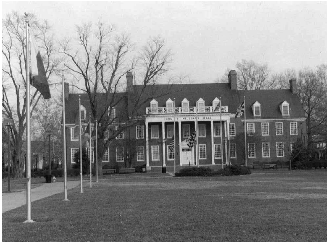
(Top) J.T. Williams Hall, named for a former chief executive officer, serves as the main administration building for the University of Maryland Eastern Shore.

The University of Maryland Eastern Shore was listed in the National Register of Historic Places for its association with higher education and ethnic heritage.