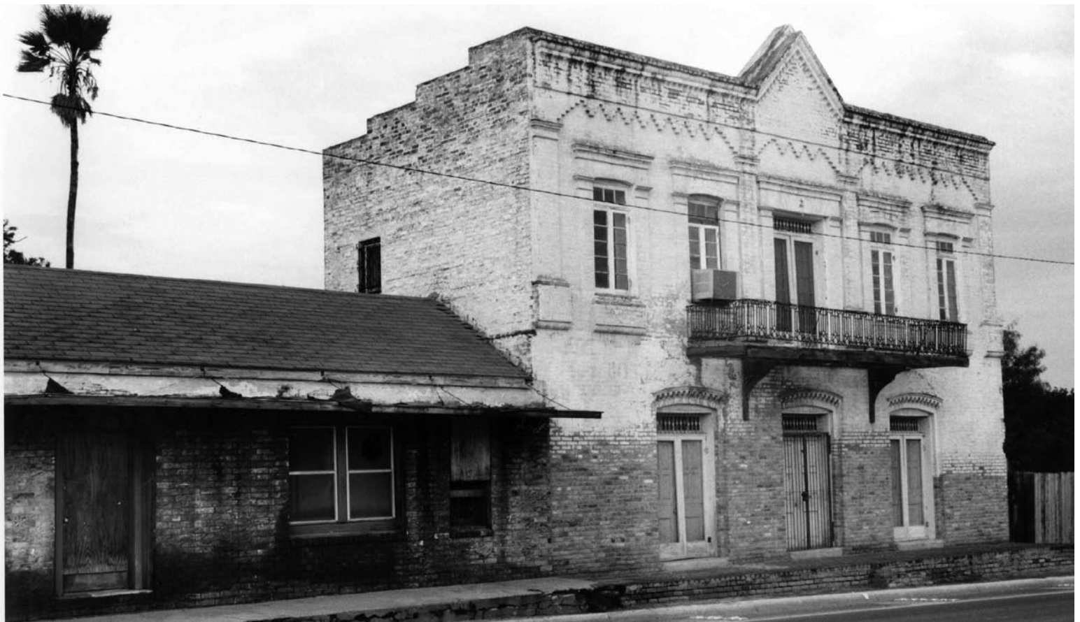
(Above) The Renaga-Headley-Edgerton House located on Second Street, is one of 84 contributing resources to the Rio Grande City Downtown Historic District, Texas.