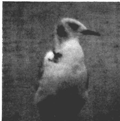
Black-legged Kittiwake ( Rissa tridactyla) photographed at Lincoln 20 April 1981.