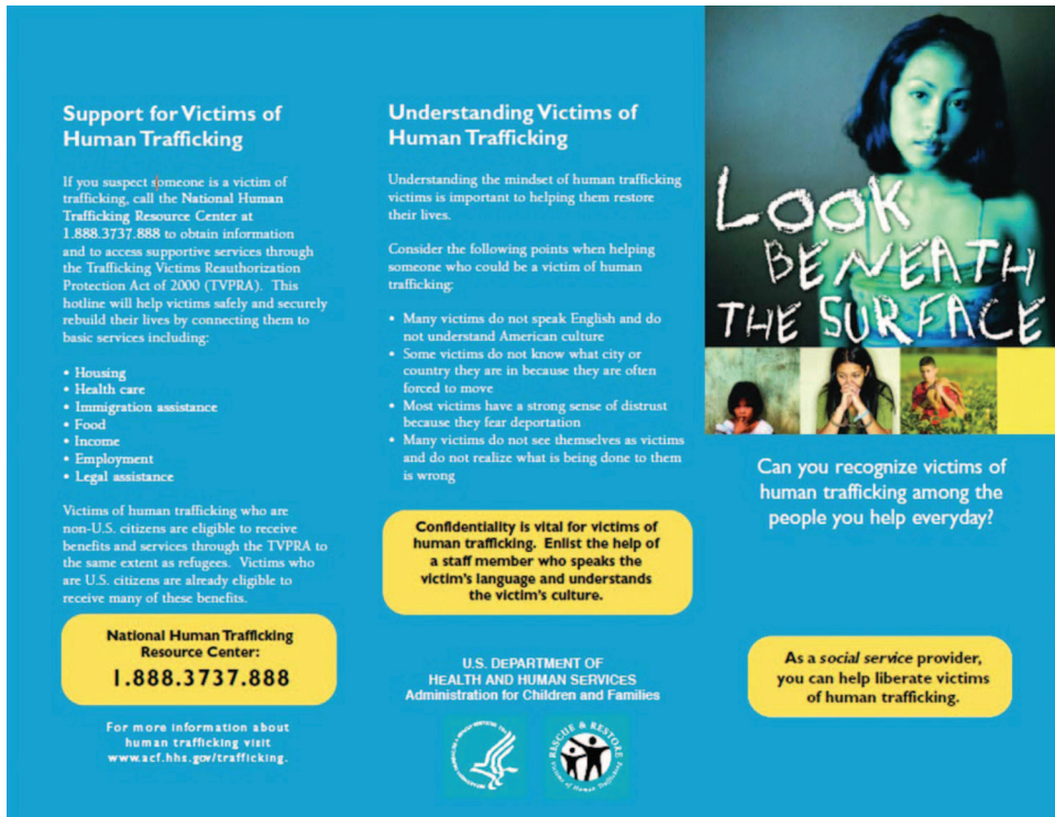
Figure 4. Poster: "Look Beneath the Surface."