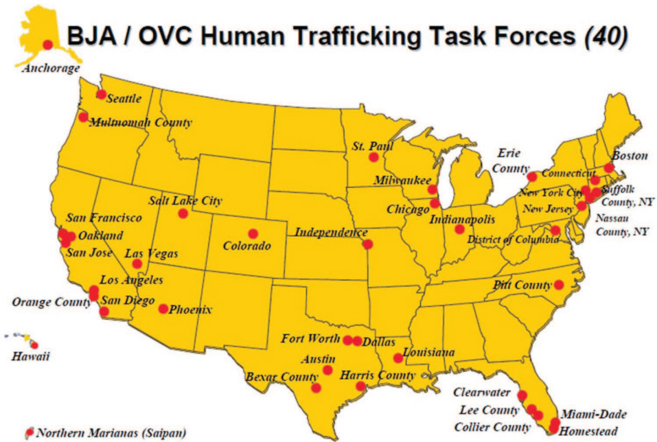
Figure 1. BJA/OVC Human Trafficking Task Forces (40).