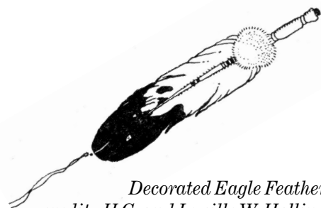
Decorated Eagle Feather

Take of Golden Eagle Nest. This permit is available only to parties engaged in a resource development or recovery operation, and it only applies to inactive golden eagle nests.