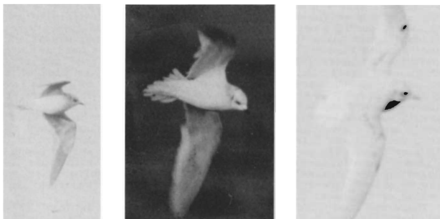
Photos of Ross' Gull at Sutherland Reservoir 23 December, 1992

During all of our observations, the small size, dark underwings, and wedge-shaped tail set this bird apart from the Bonaparte's Gulls. At first, we overlooked the tail shape and tentatively identified the bird as a Little Gull. However, after studying the bird in greater detail, we noted the wedge-shaped tail and agreed that it was indeed a Ross' Gull in second-winter plumage.