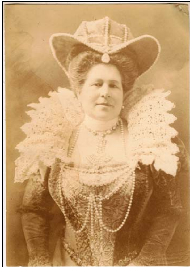
Figure 1. Archduchess Isabella 1896. Photo: © Hungarian National Museum 67.1709.

Aristocratic woman played an important role disseminating design, notably, Archduchess Isabella in the Austro-Hungarian Empire. Her influence on the aesthetics, production and promotion of peasant inspired design was considerable at the turn of the nineteenth century. The Archduchess (1853-1931) came from the Westphalian Croy-Dülman family, her mother was the Belgium Princess de Ligne. (Figure 1). The Catholic Croy family regarded themselves as descendants of the House of Árpád, Hungary's first royal dynasty. In 1878 she married Frederick, a member of the wealthiest branch of the Habsburg family at the Hermitage Palace, Belgium. Her husband pursued a military career based in Pozany (today Bratislava) and they lived either at the former Grassalkovich Palace, Pozany or on their vast modern, well equipped, mechanised Habsburg estates. 1