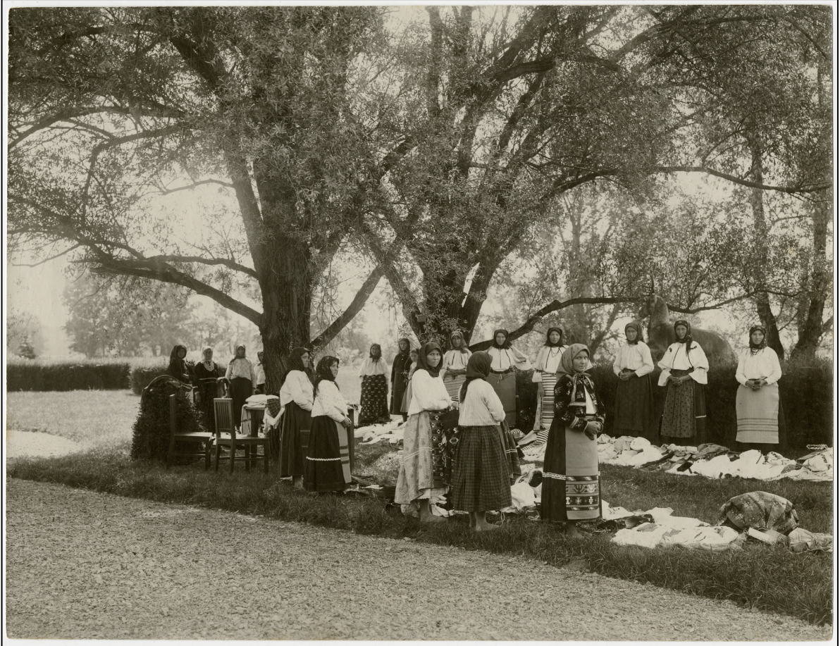
Figure 3. Sokác Slav immigrants at Bélye estate selling works by the roadside 1913. Photo: © Hungarian National Museum 85-1024.

Isabella's goal was to help the poorer classes of the people, especially during winter and to promote sales. (Figure 3). She emphasized the handmade and sartorial preference for a 'Hungarian' style typified the promotion of textiles consumption during that era. Undoubtedly Isabella used her high society connections and photography skills to promote the Hungarian home industry work. She remained devoted to the making and selling of textiles and textile art and combined her resolve with an astute sense of market, an awareness of social and political conditions encouraging both designer led industries and others that relied on patterns and textile artefacts as models. 24