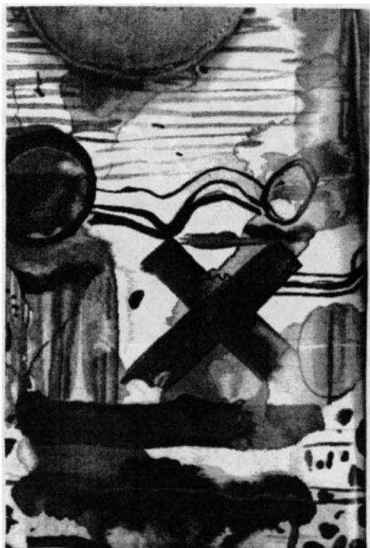
Fig. 3. VTW, Melbourne, Happy Days , 1994, (tapestry detail), (after John Olsen).