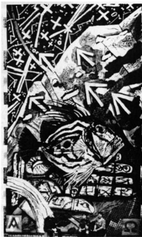
Fig. 4. VTW, Melbourne Aotea Tapestry , 1997, (after Robert Ellis)