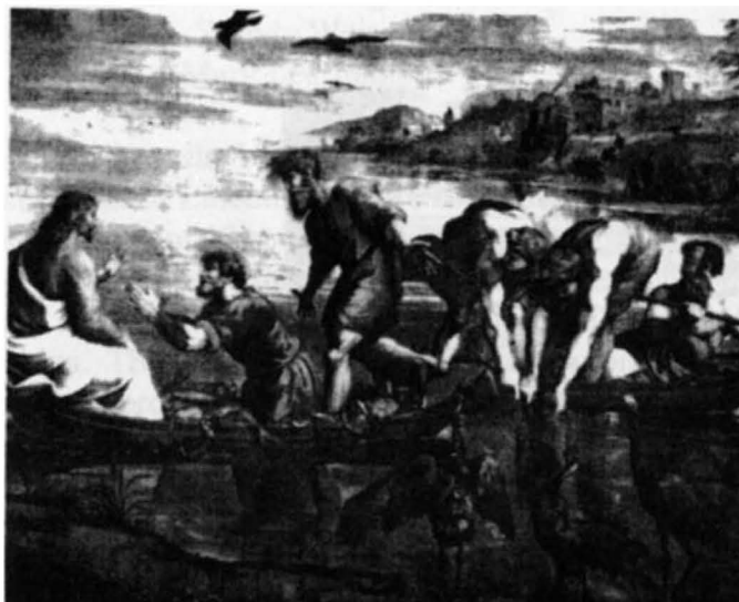
Fig. 1. Victoria & Albert Museum, The Royal Collection, The Miraculous Draft of Fishes , 1515-16, (tapestry cartoon) (after Raphael).