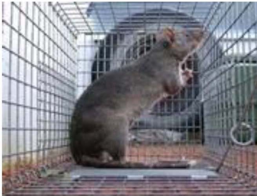
Figure 3. Gambian giant pouched rat captured in a cage trap on Grassy Key, Florida.

Gambian giant pouched rats ( Cricetomys gambianus ) are native to a large area of central and southern Africa. They had become popular in the pet industry in some countries and became established on Grassy Key in the Florida Keys in 1999, following an escape or release by a pet breeder (Engeman et al., 2006; Perry et al., 2006). Despite a prolonged eradication effort, a free-ranging and breeding population remained on the island (Engeman et al., 2006; Engeman et al., 2007). There is a concern that if this rodent reaches the mainland, there could be damage to the Florida fruit industry because Gambian rats are known to damage numerous types of agricultural crops in Africa (Fiedler, 1994). Imported Gambian rats may also pose risks as reservoirs of monkey pox and other diseases. An outbreak of monkeypox occurred in the Midwestern United States in 2003 as a result of infected Gambian rats imported from Africa for the pet industry (Enserink, 2003). A climate-habitat modeling study suggested that their new range in North America could expand substantially were they to become established on the United States mainland (Peterson et al., 2006).