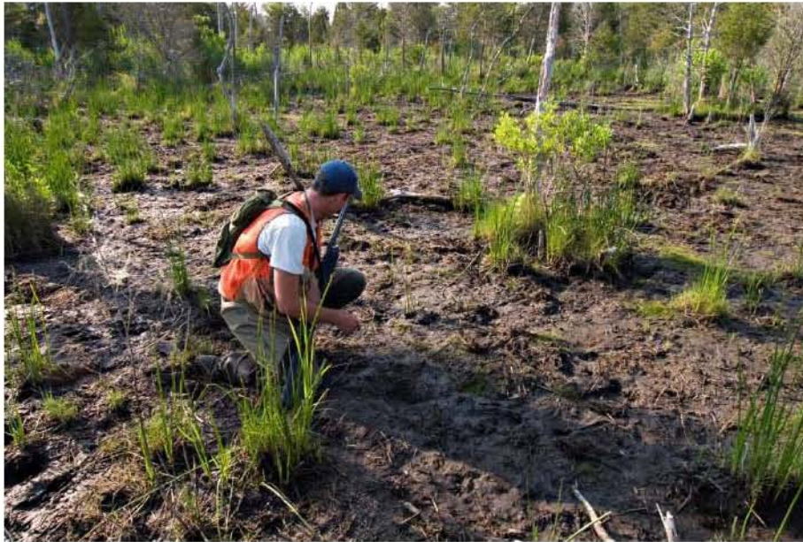
Figure 2. Nutria damage to marsh vegetation in Maryland.

known to completely denude vegetation from areas where they feed before moving on. Their ease of mobility on land and in water makes them effective dispersers, posing significant challenges for resource managers.