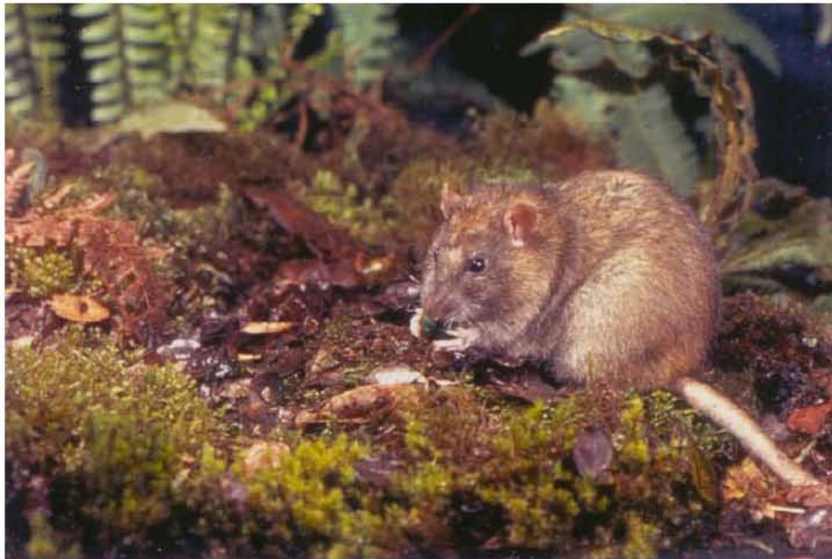
Figure 1. Introduced rodents, such as this roof rat, can cause extensive damage to island flora and fauna.

Numerous invasive rodents have become established in parts of the United States and its territories (Figure 1). The species include several species of Rattus , house mice ( Mus musculus ), Gambian giant pouched rats ( Cricetomys gambianus ), ground squirrels ( Spermophilus parryii ), nutria ( Myocastor coypus ), hoary marmots ( Marmota caligata ), and arctic ground squirrels ( Spermophilus parryii ). While most were introduced accidentally, some were introduced for food or fur. Additionally, some native species of rodents (voles, Microtus spp. and deer mice, Peromyscus spp.) have been placed on islands, at least on a temporary basis, to study rodent species interactions (e.g., Crowell, 1983; Crowell and Pimm, 1976). Introduced rodents have caused serious impacts to native flora and fauna, agriculture, property, and other resources. Long (2003) reviewed the many rodent introductions around the world.