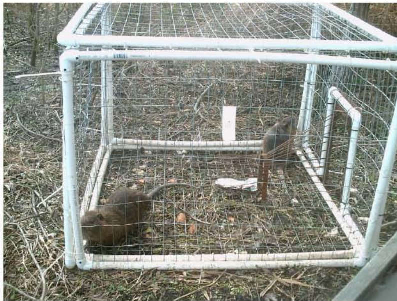
Figure 6. Nutria in an experimental multiple capture live trap in Louisiana.