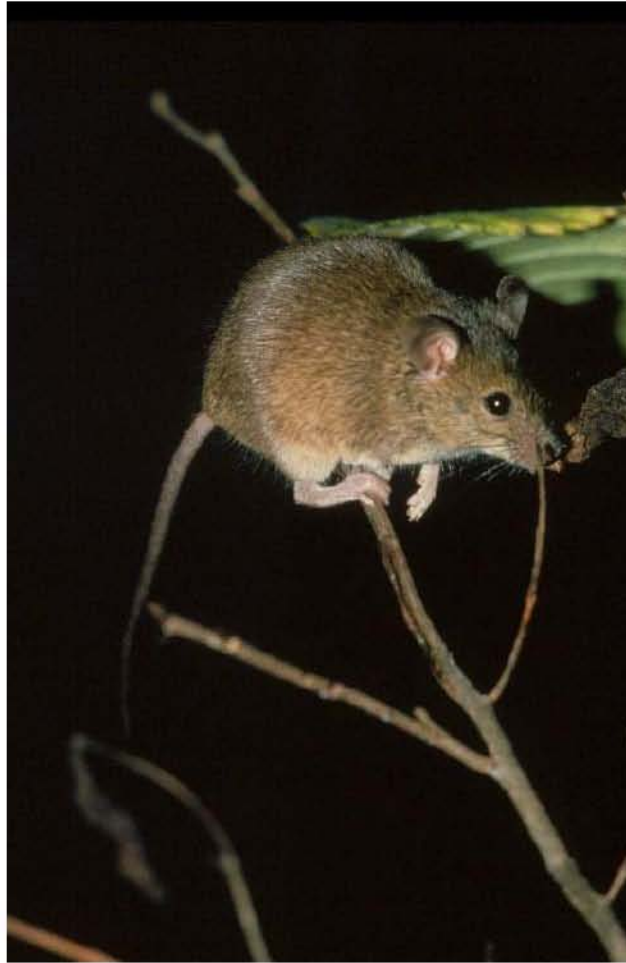
Figure 5. House mice have amazing abilities which allow them to access almost any available areas or resources.

House mice cause many types of damage (Timm, 1994b; Witmer and Jojola, 2006). A major concern is the consumption and contamination of stored foods; it has been estimated that substantial amounts of stored foods are lost each year in this manner. Mice also consume and contaminate large amounts of livestock feed at animal production facilities. While mice generally live in close proximity to humans (Corrigan, 2001), sometimes feral populations occur. In these cases, the mice may damage many types of crops in the field, especially corn, cereal grains, and legumes. Australia has mouse “plagues” periodically resulting in enormous losses to stored crops and crops in the field (Brown et al., 2004). In buildings, a mouse infestation can be a considerable nuisance because of the noise, odors, and droppings. More importantly, they damage insulation and wiring (Hygnstrom, 1995). House fires have been caused by mice gnawing electrical wires; likewise, communication systems have been shut down for periods of time resulting in economic losses. Additionally, house mice are susceptible to a large number of disease agents and endo-parasites. Consequently, they serve as reservoirs and vectors of disease transmission to humans, pets, and livestock (Grantz, 1994). Important among these diseases are leptospirosis, plague, salmonella, lymphocytic