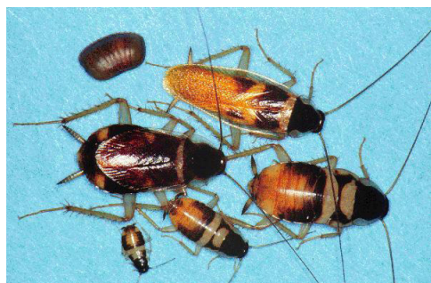
Figure 3. Brownbanded cockroach.