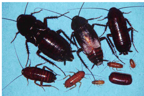
Figure 2. Oriental cockroach.