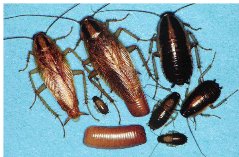
Figure 1. German cockroach.

Brownbanded cockroaches, which need less water than the German cockroach, can live in kitchens and bathrooms as well as in living rooms and bedrooms. Although common in southern states, American cockroaches are not found very often in Nebraska homes, but they are sometimes found in old buildings that have steam heat. American cockroaches are also found in sewer systems.