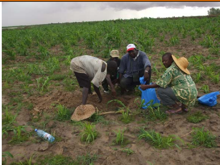
Soil sampling before fertilizer application. Soil nutrient deficiency plot in Mopti