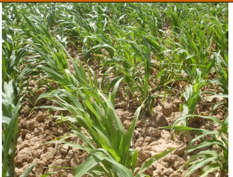
Sorghum plots of a variety test in Bourem. July 2010.