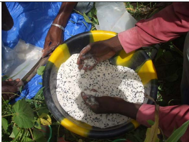
Mixing fertilizer before its application on sorghum. Soil nutrient deficiency study in Goundam