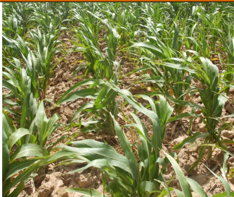
Sorghum plots of a variety test in Bourem under IER- INTSORMIL-USAID MALI partnership. July 2010.