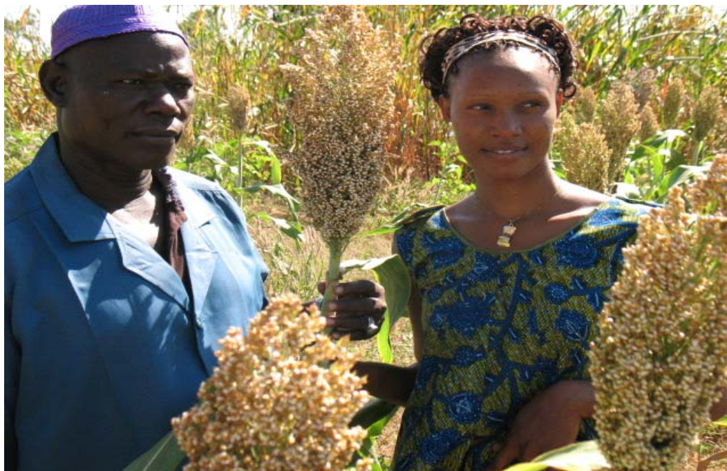
Farmer and AMEDD NGO Agent with Grinkan, summer 2008

Some pictures are included of two different combinations of Guinea and Caudatum both developed by Acar Toure of IER, Mali. Niatitiama has been very successful in Kafara but the seed quality issue has still not been resolved. Grinkan has been an outstanding success in the cotton area of Koutiala and we will be attempting to substantially increase the area in Grinkan in 2010. It is too early for hybrids in most sorghum regions as farmers still need to be convinced of the need to pay higher prices for improved cultivars and to buy annually but the next step in the regions with the successful introduction of these improved Caudatum-Guinea crosses will be the introduction of hybrids.