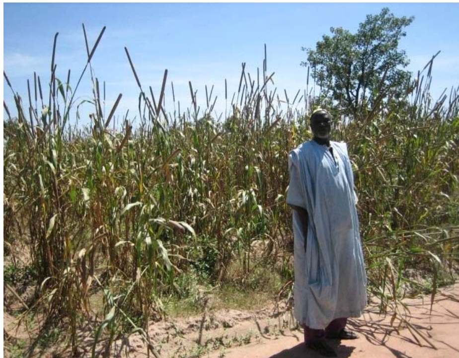
Head of farmers' association in Tingoni with Toroniou millet cultivar.

In conclusion sorghum and millet are no longer only low income food staples. There are important expanding markets for processing them (millet food products and poultry feed rations). New varieties available from national research activities respond well to inorganic fertilizer. Higher input use on sorghum and millet, combined with better marketing and institutional evolution of farmers' associations, leads to high outputs and profitability. The yield increases from the combined improved practices consistently increased incomes while maintaining household food security. Moreover, several components of the technology package and the marketing strategies reduce the risk of higher input use.