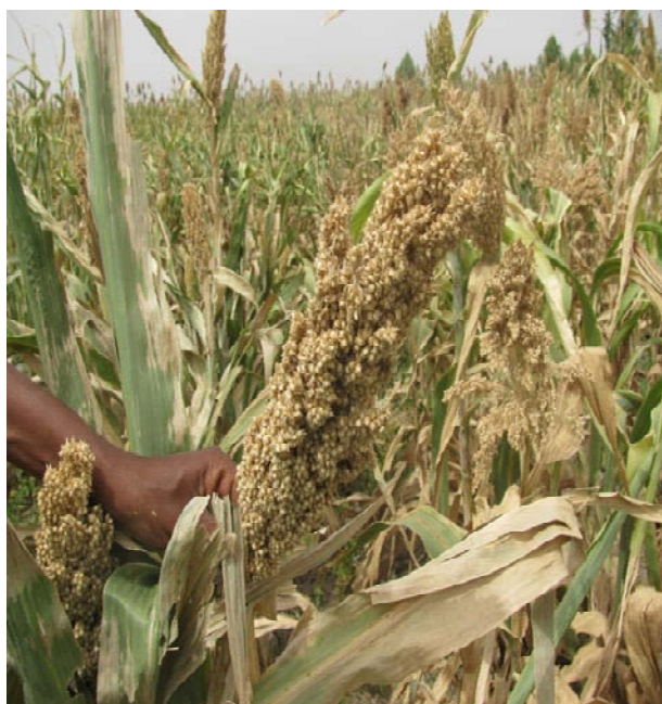
Niaticama sorghum grown under décrue conditions