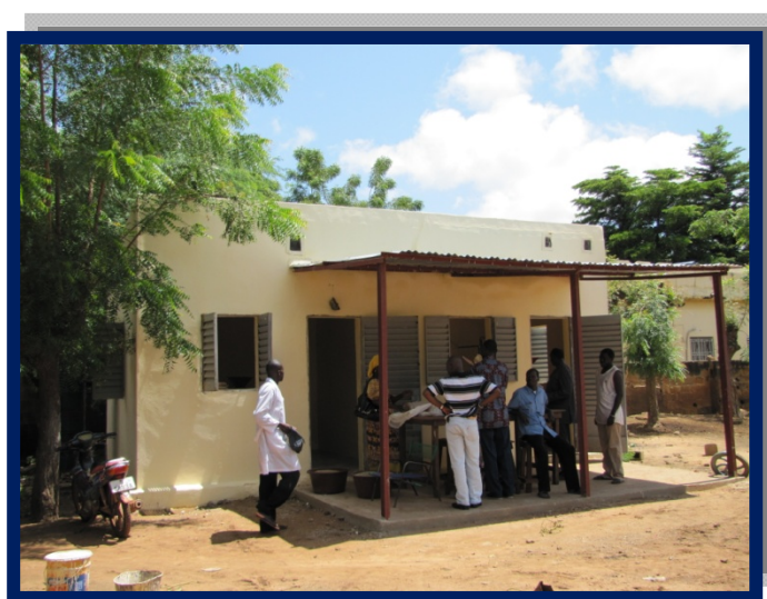
Processing units under development in the Mopti/Gao/Bandiagara area