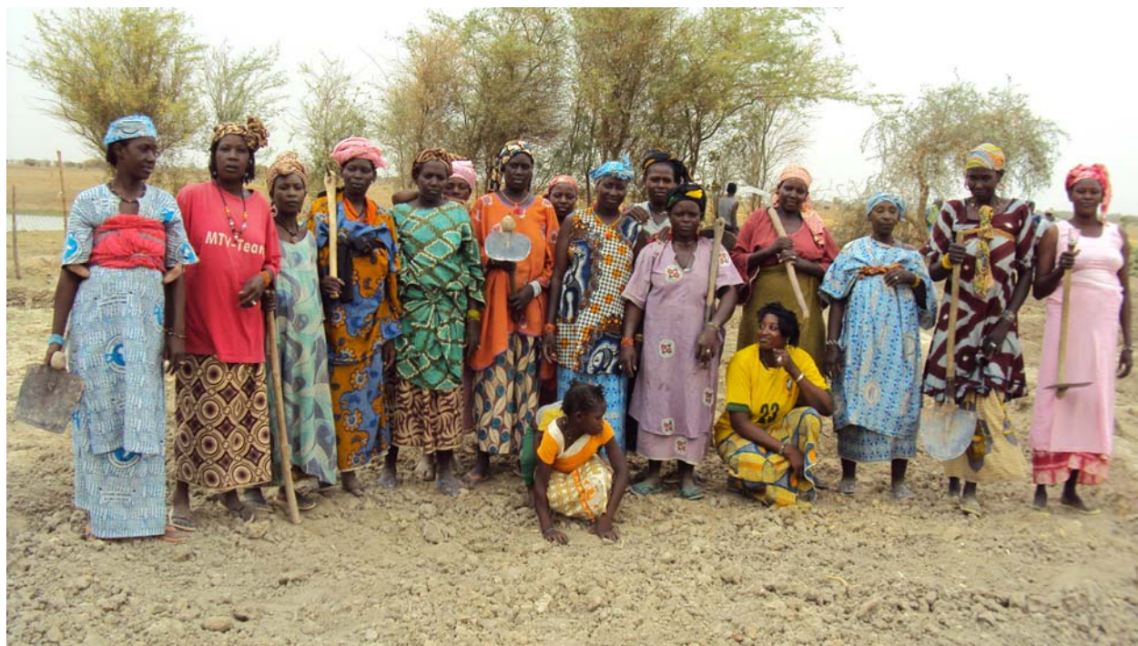
Women's association Nafagoumo at the Tombouctou area

In Goundam, moisture conditions are now favorable to apply all fertilizers planned for the soil fertility study. A trip is planned for this week to finish not only the fertilizer application but also to visit the plots conducted by other NGOs not visited so far.