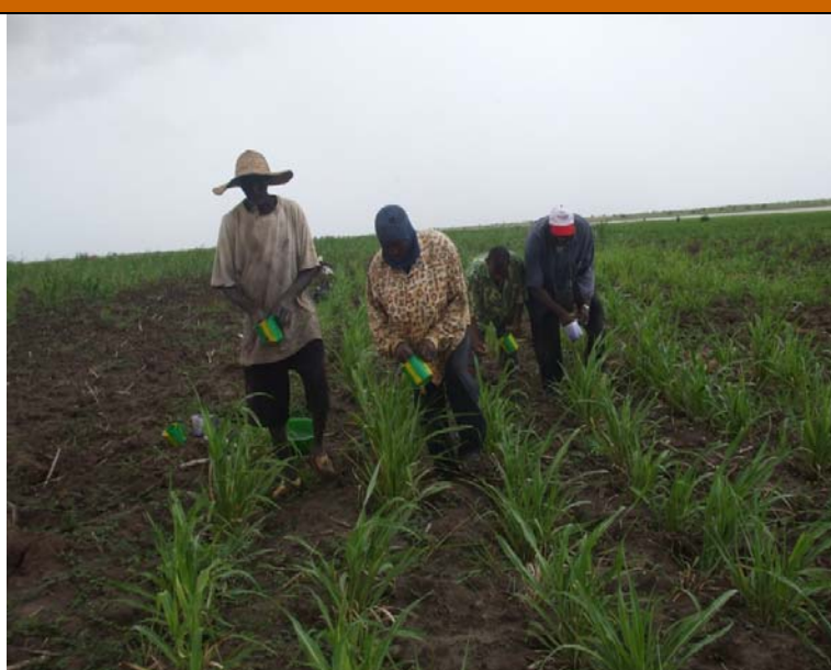
Fertilizer application on soil nutrient deficiency plot in Mopti. July 2010.