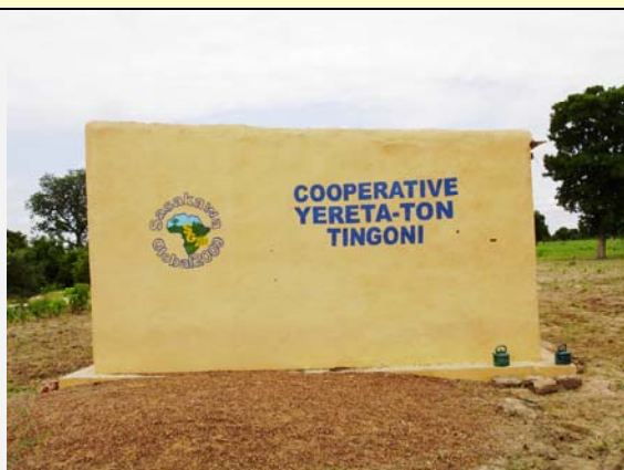
Cooperative Yereta-Ton, Tingoni

Cooperative Yereta-Ton, Tingoni, site of field visit. INTSORMIL collaborates with Sasakawa Global 2000 at this site. Grain storage structure was constructed by Sasakawa Global 2000.