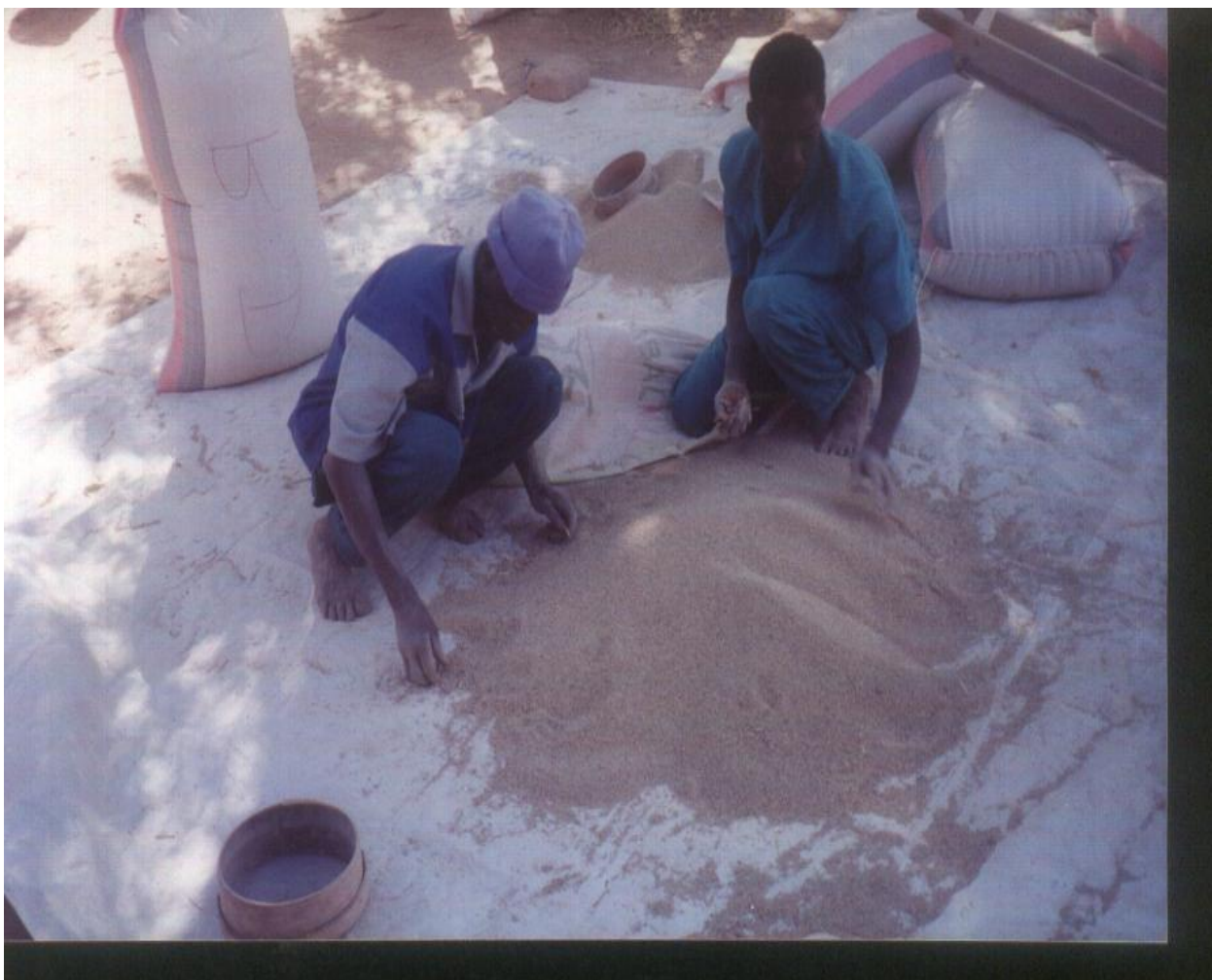
Farmers threshing sorghum on a tarp in Tingoni Mali.