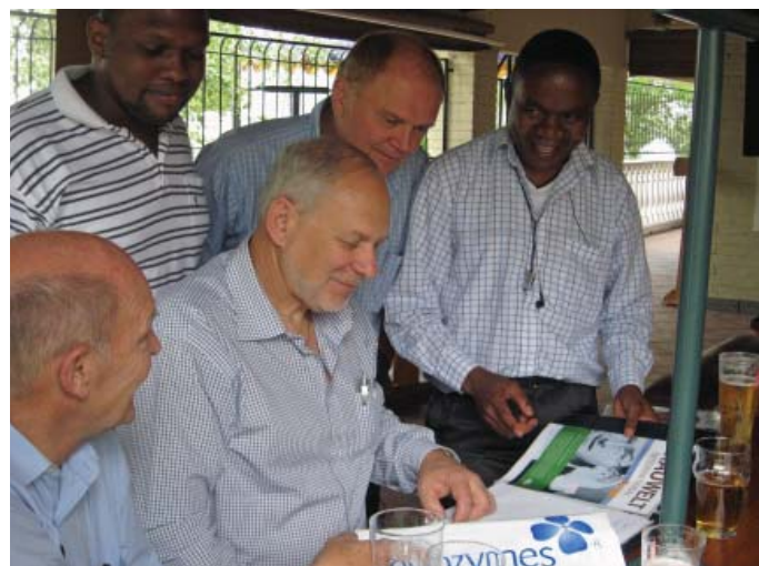
Pretoria University Food Science students from Zambia explaining their research to representatives of Novozymes SA, a company that partially sponsored their research.