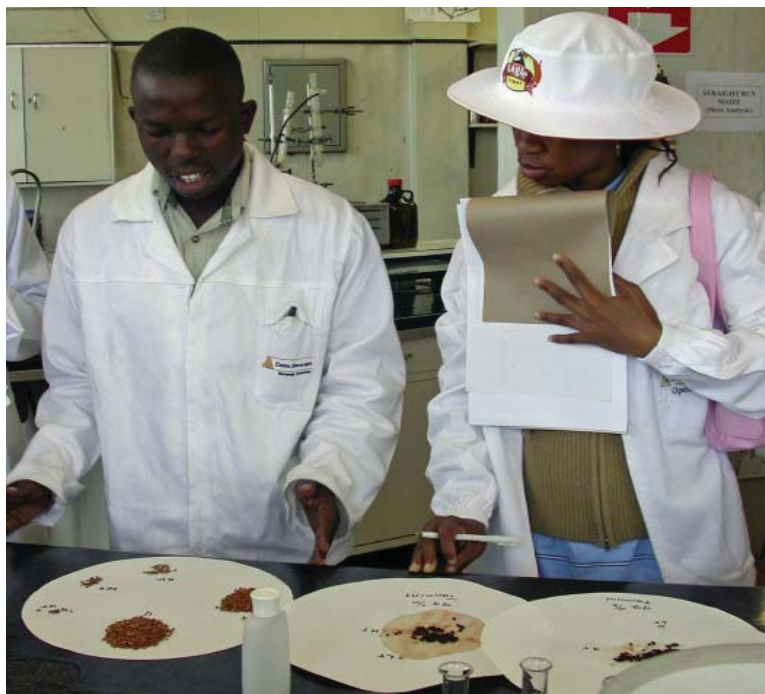
A technician in a brewery demonstrating the Simple Bleach Test. As can be seen on the middle and right filter papers, the tannin sorghums stain black.

In the late 1980s, the Nigerian government briefly banned the importation of cereal grains like barley and wheat with the aims of saving foreign exchange and forcing brewers and bakers to use locally grown grains. With much ingenuity, the brewing companies in Nigeria, were able to use sorghum to successfully brew their lager and stout beers. Despite the cereal importation ban having been rescinded for many years, sorghum