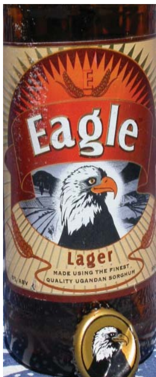
The sorghum component of Eagle Lager is clearly evident on the bottle label

“Sorghum lager and stout beer brewing is a great African success story that has benefited everyone in the value chain from farmers, through brewers to the consumer”