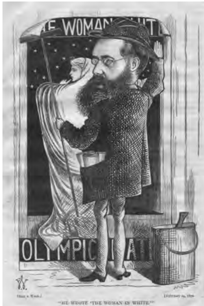
Figure 3. This caricature of Collins appeared in ‘Caricature Portraits of Eminent Public Men’ in James Rice’s February 1872 edition of Once A Week during the time in which Collins’s dramatic version of The Woman in White was being performed in London at the Olympic theatre. Pasting an advertisement of the play that is as large as his person, the cartoon satirizes Collins’s self-promotional efforts--particularly since his pocket is full of more Woman in White posters. Alongside the caricature appeared a short sketch of him, which both celebrated and questioned his authorship: “THE subject of our cartoon, Mr. Wilkie Collins, is one of the most successful novel writers of the day. His English is not drawn from the purest fount, nor is his literary style to be compared with that of several living writers. He is a manufacturer of interesting works of fiction, pure and simple. He has made it his business in life. And, under the circumstances, it is perhaps a little provoking that he should so often ring the changes on such phrases as ‘my art,’ ‘my purpose in writing the book,’ ‘the object I had in view,’ &c., &c., &c., as each of his later novels has probably brought him £4,000 . . . We should place ‘Man and Wife’ among his best productions; but in literature he will be remembered as the author of ‘The Woman in White.’ That wonderful story made him famous.”