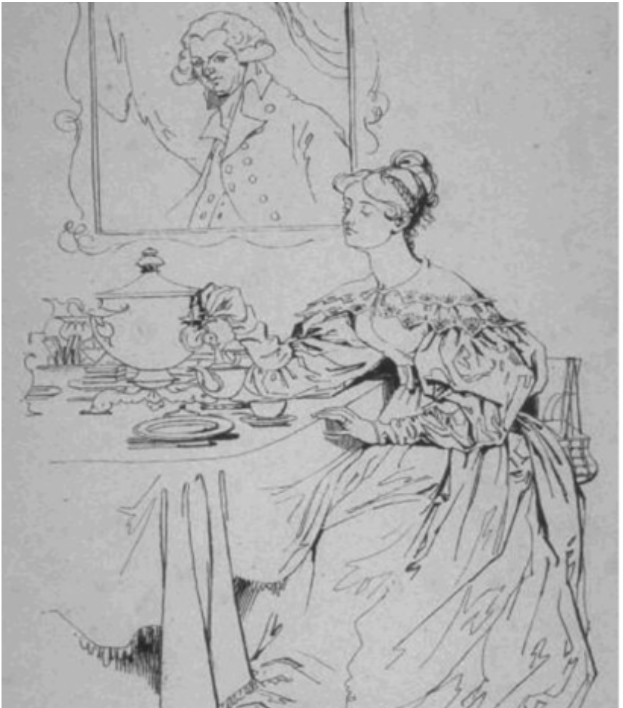
Figure 1. "Caroline Norton," Fraser's Magazine 3 (March 1831).