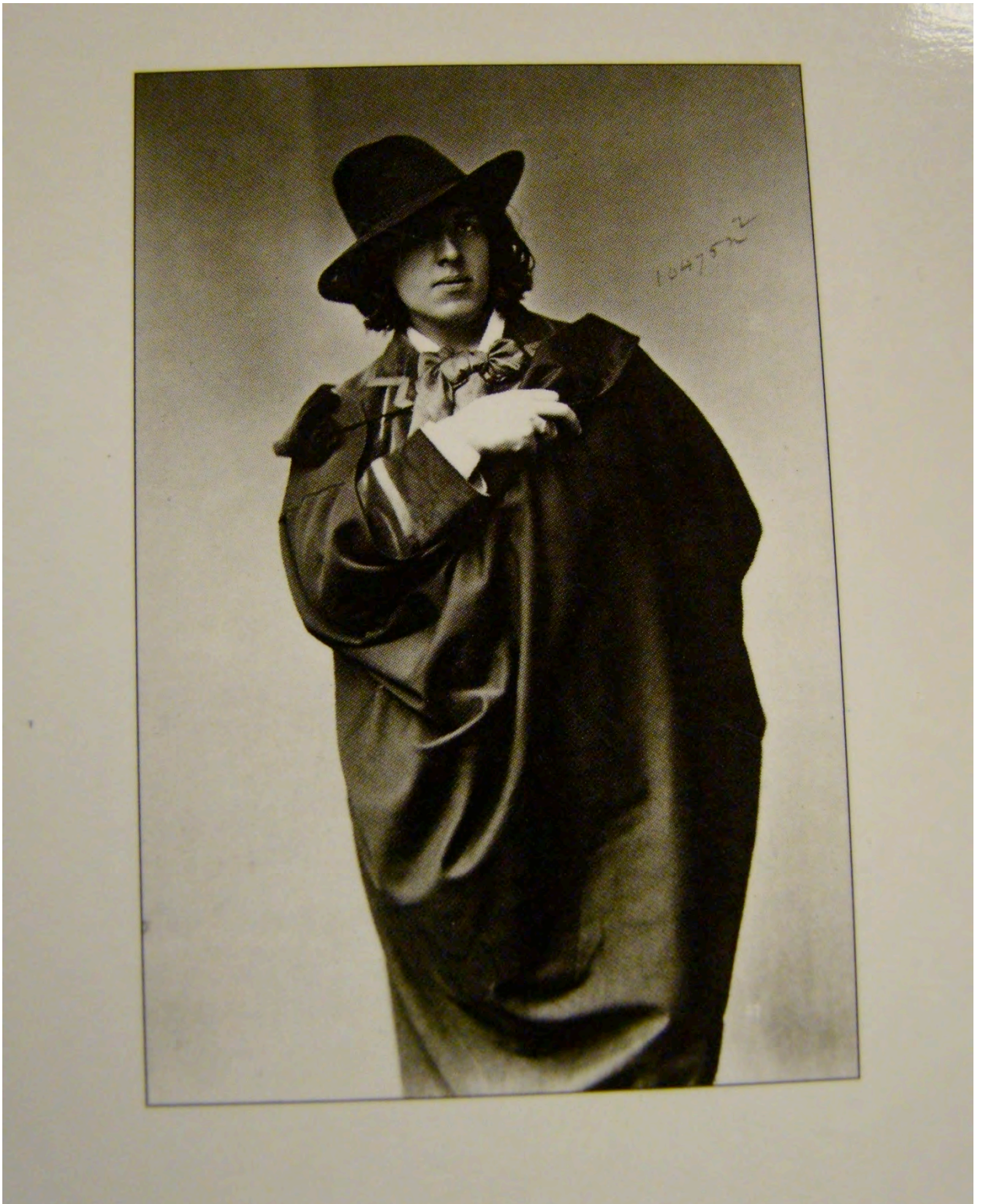
Figure 12.