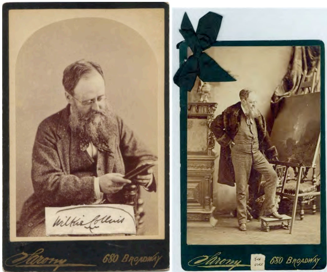
Figures 5 and 6. Two photos/carte-de-visites of Collins created by Napoleon Sarony in March 1874.