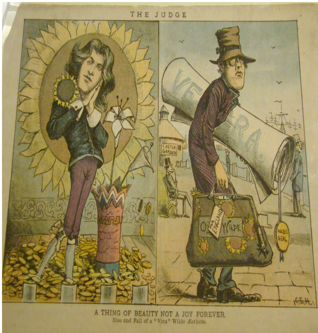
Figure 14. From The Judge. The illustration on the left depicts Wilde the Aesthete, surrounded by traditional emblems of aestheticism and posturing atop a heap of gold coins. The image on the right depicts Wilde the Playwright, who appears to be in a much more haggard and dull state, as he makes his return to England following the critical and commercial failure of his play Vera in America. Printed in September 1883, this caricature points to the real source of Wilde's fame and success at the time, and even ridicules him for his attempts at authorship.