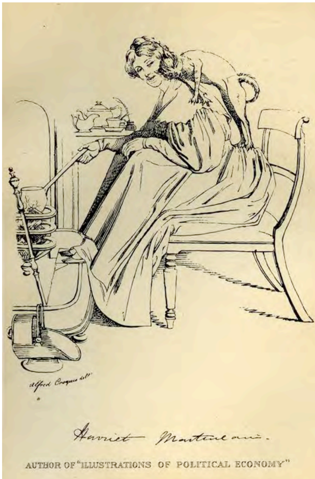
Figure 2. "Harriet Martineau," Fraser's Magazine 8 (November 1833).