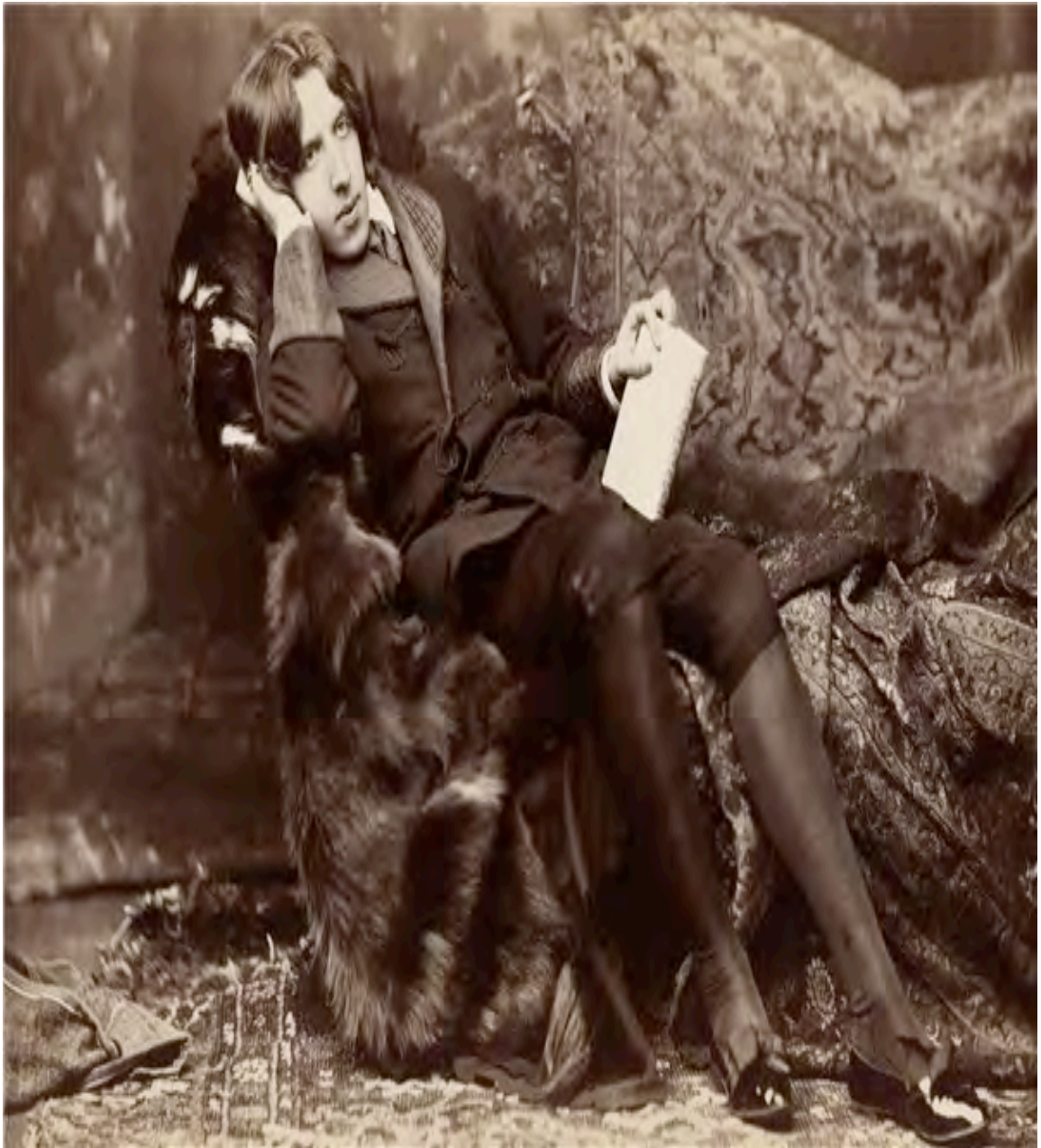
Figure 10. Photograph by Napoleon Sarony (1882). Courtesy of the William Andrews Clark Memorial Library, Los Angeles, California.