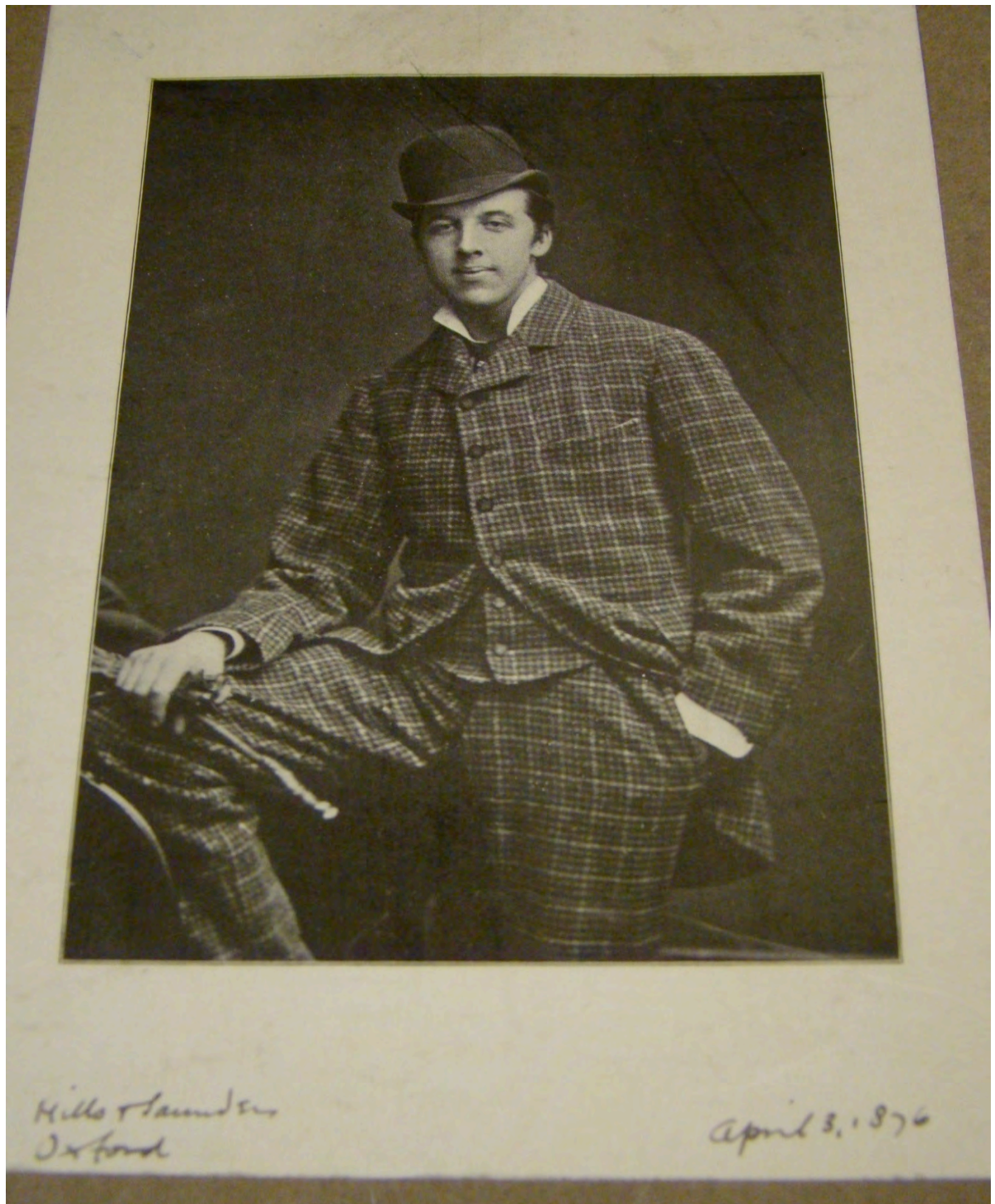
Figure 7. Wilde at Oxford. (April 1876).