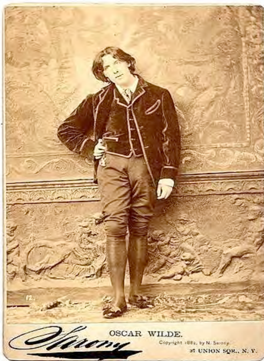
Figure 11. A collectible carte-de-visite of Oscar Wilde issued by Sarony (1882).