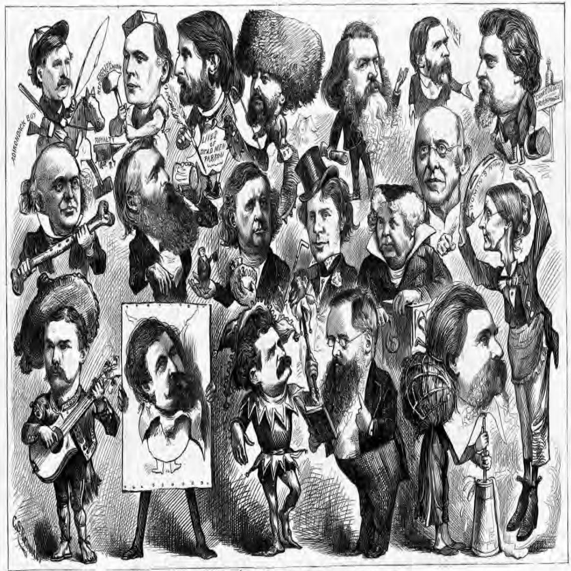
THE LYCEUM COMMITTEEMAN'S DREAM—SOME POPULAR LECTURERS IN CHARACTER.

Figure 4. In 1873, Harper's Weekly published the caricatures of some of the most famed nineteenth-century public lecturers and readers in this image entitled "The Lyceum Committeeman's Dream." Collins is prominently featured reading from his novel.