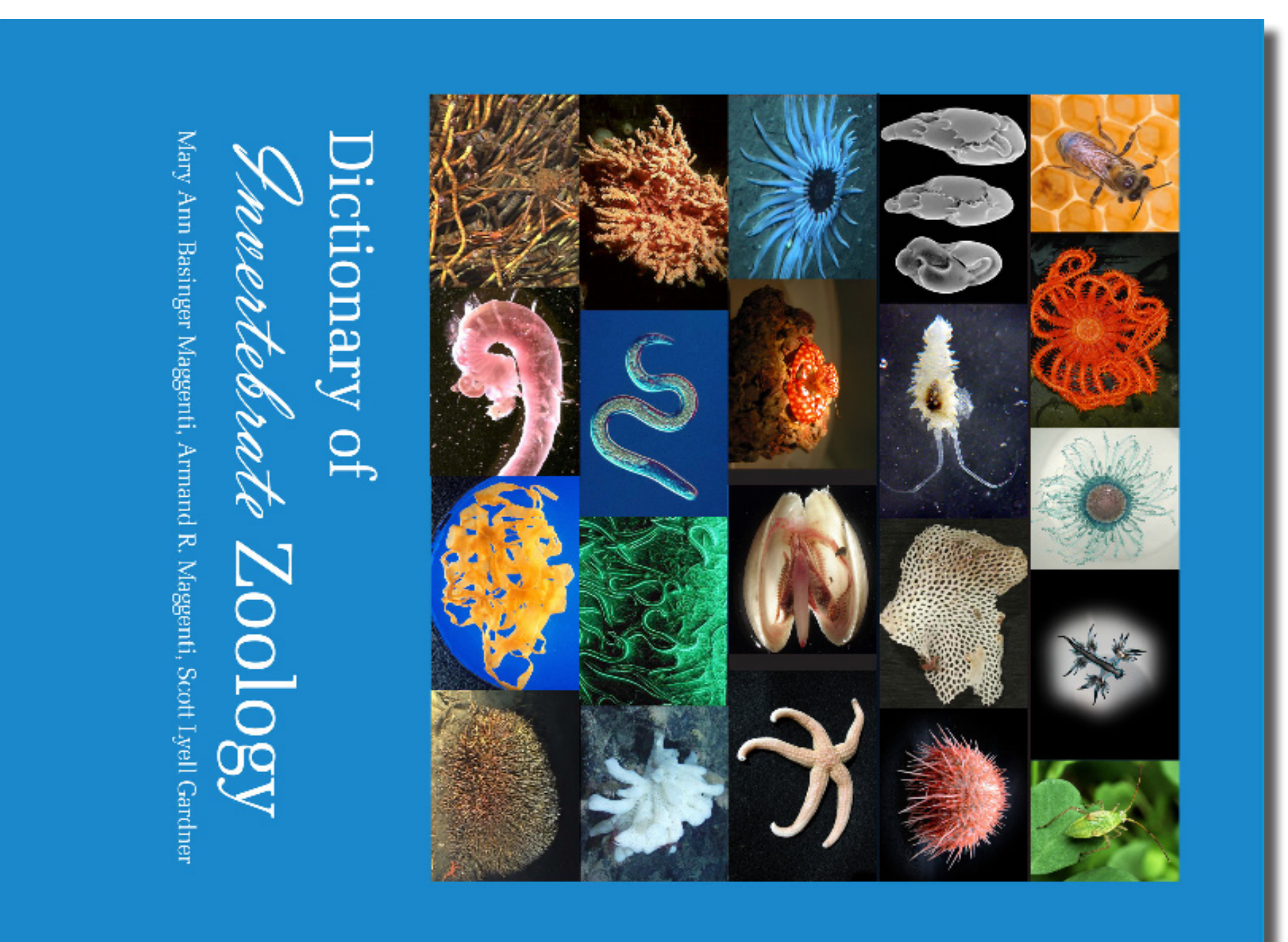
Dictionary of Invertebrate Zoology