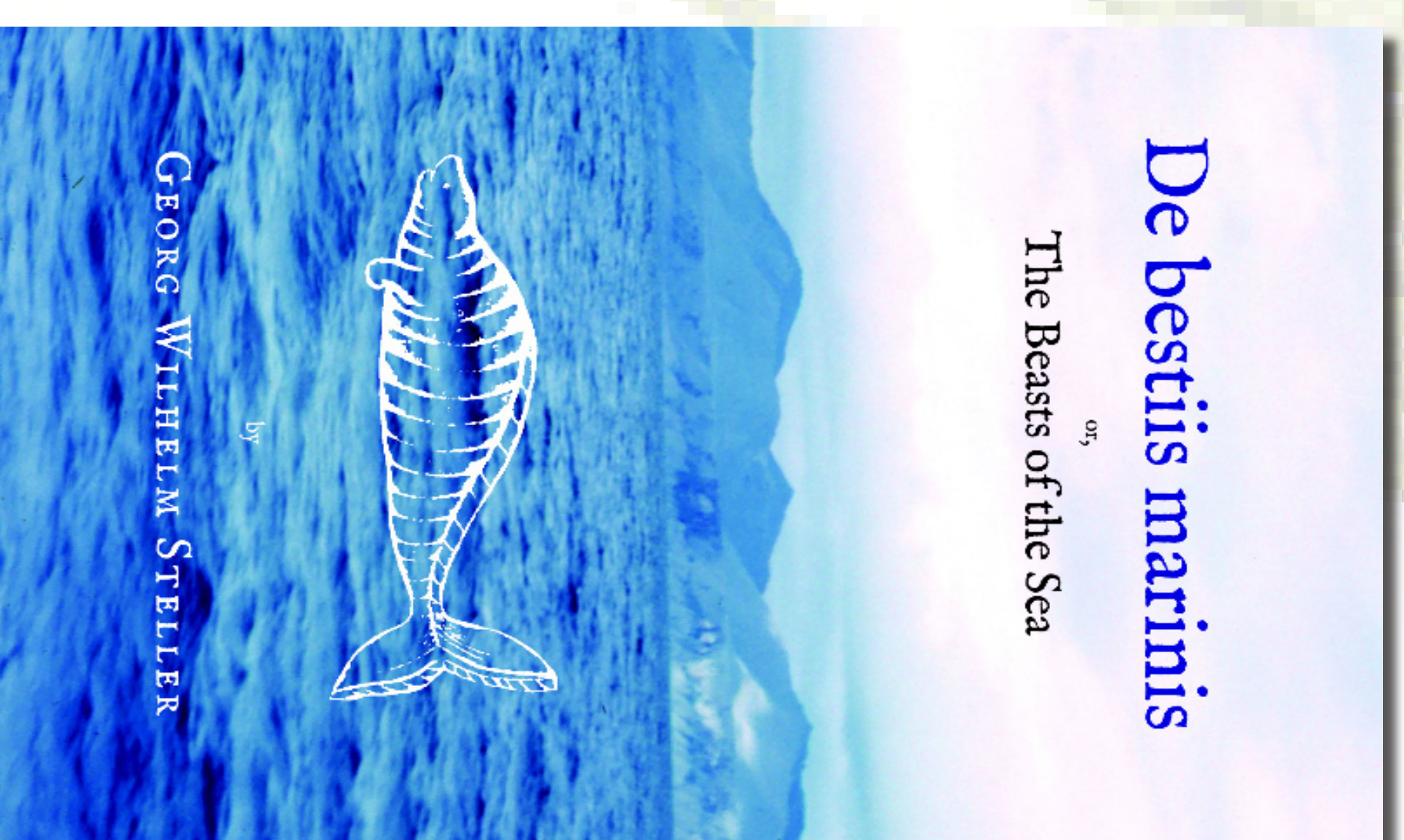
De bestiis marinis, or, The Beasts of the Sea