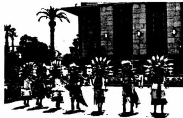
These dancers are from Hopi Junior and Senior High Schools from the Hopi Mesas performing traditional Native American dances at the State Capitol Exhibition and public reception during Archaeology Week.

In 1983, the Archaeology Advisory Group and SHPO coordinated the production of radio public service