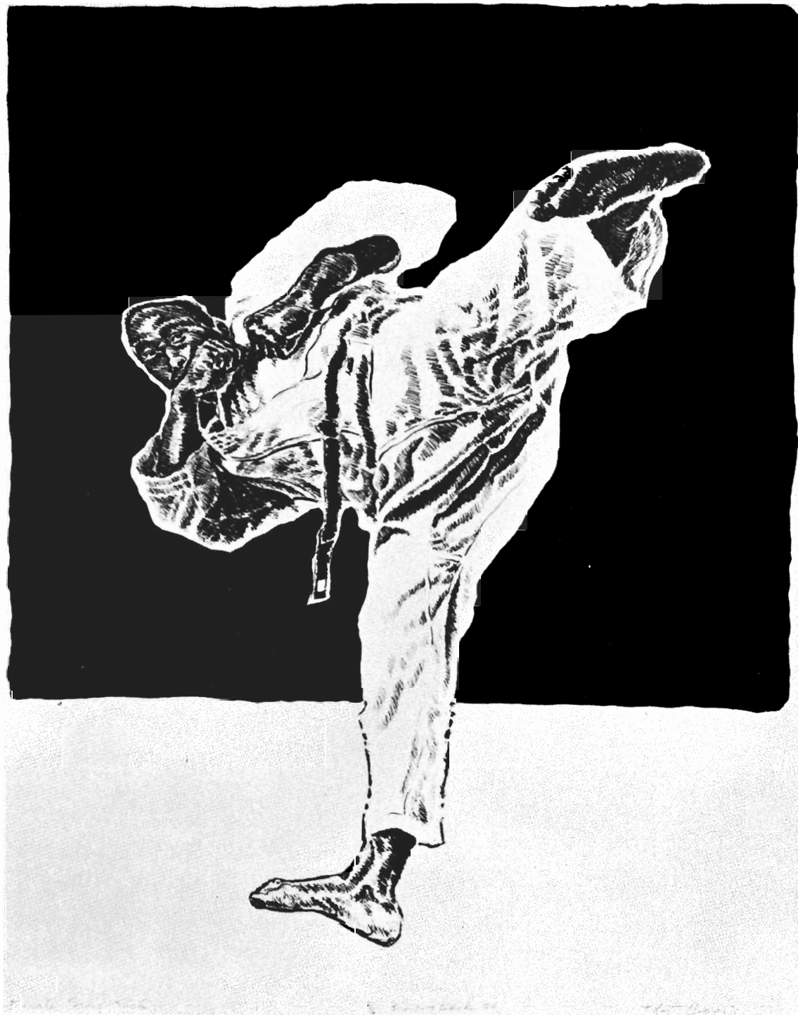
KARATE SIDE KICK