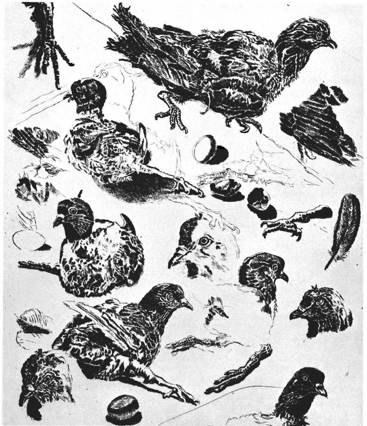
STUDY OF A CRIPPLED PIGEON