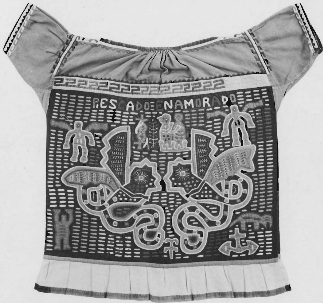
THE UNIQUE ART OF MOLAS