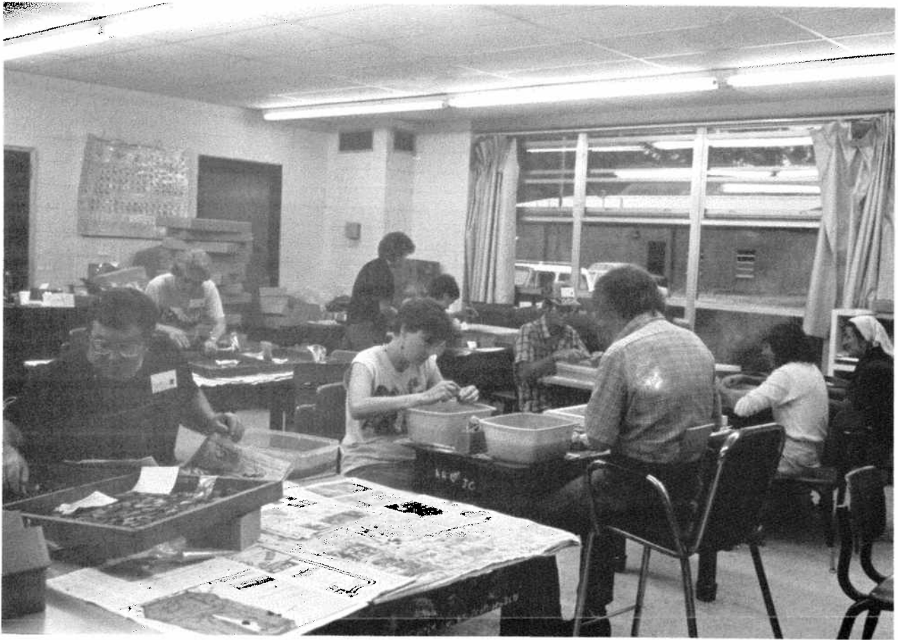
Figure 8. The science classroom of the Sparkman High School converted into an archeological processing lab, June 1987.

The Survey archeologist, who is field director for the summer program, spends at least a month full time prior to the field program figuring out how to make best use of 120 to 140 people over a 2-week period to achieve the goals of the research. At the time of the field program, 10 to 12 staff members devote from 10 to 20 days full time to the program, either teaching seminars or acting as supervisors in the field or lab, or both. This takes archeologists away from their own research, interrupting their own programs, which always need attention.